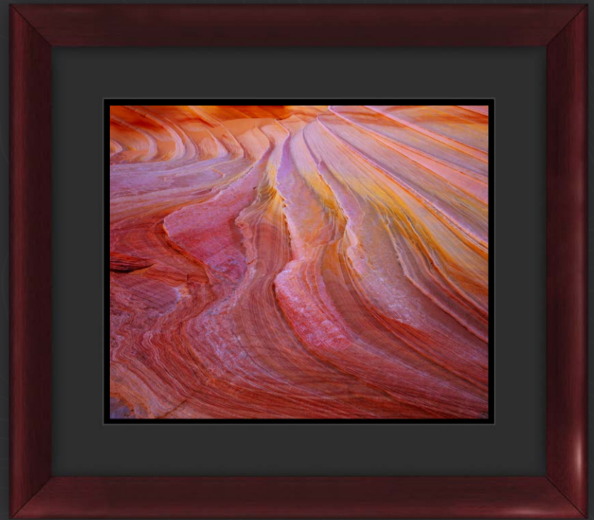
Large Artist Series: Black Museum Board