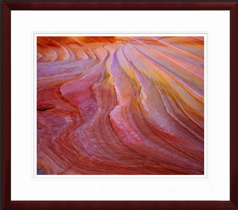
Artist Series: White Museum Board