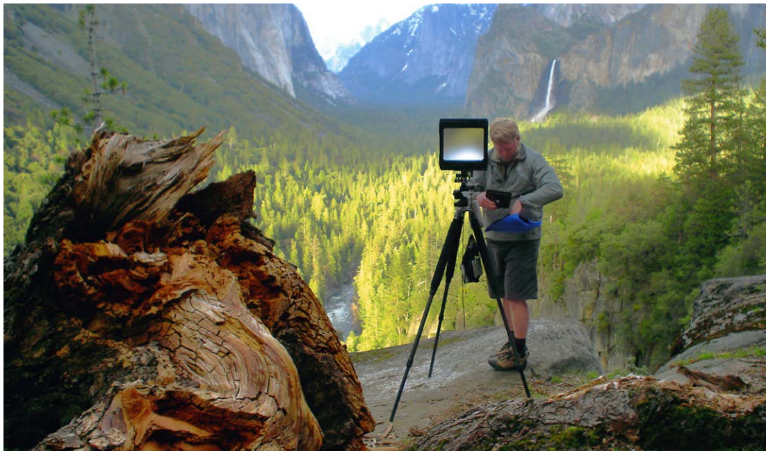
Yosemite National Park California, USA