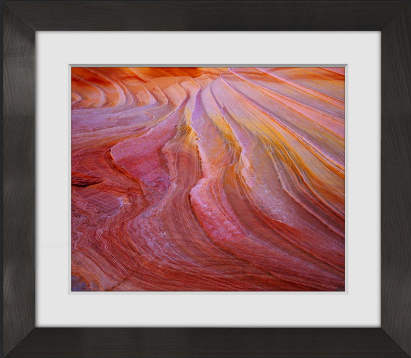
Della Terra: Charcoal with White Linen