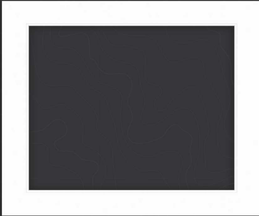
White Museum Board