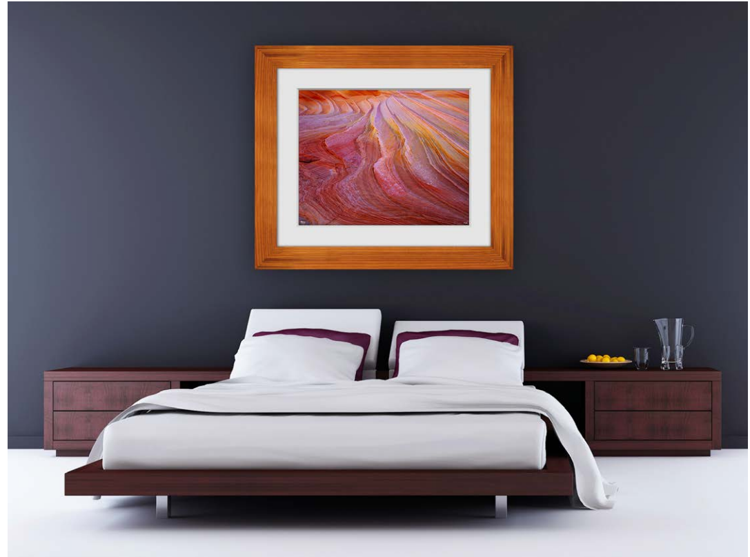
40x50 - Koa with White Linen

* Koa framing can be used on both Artist Series and Della Terra framing styles.