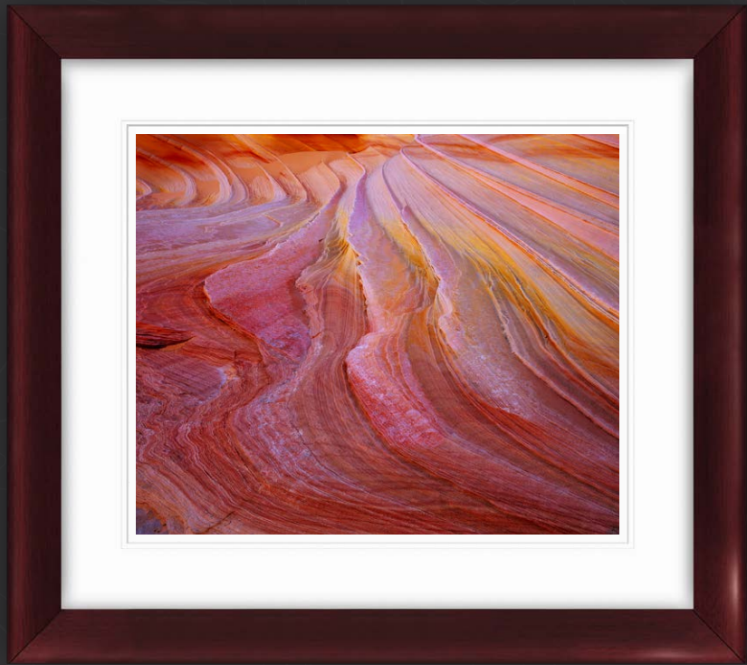
Large Artist Series: White Museum Board