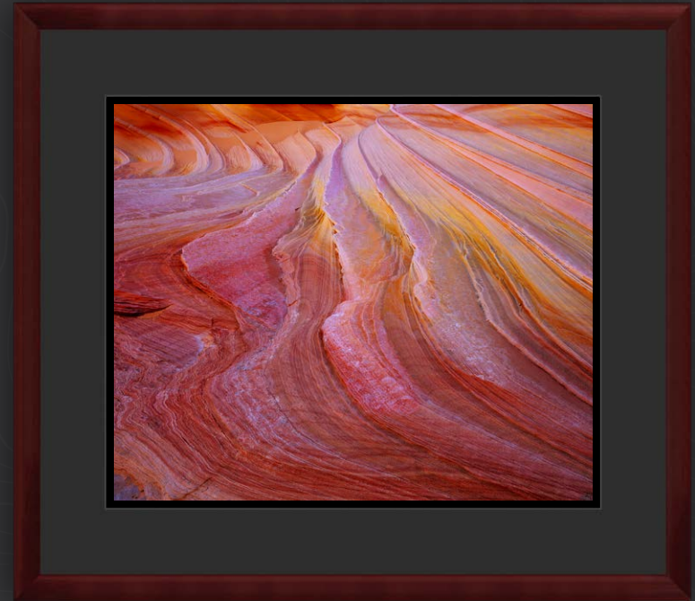
Artist Series: Black Museum Board