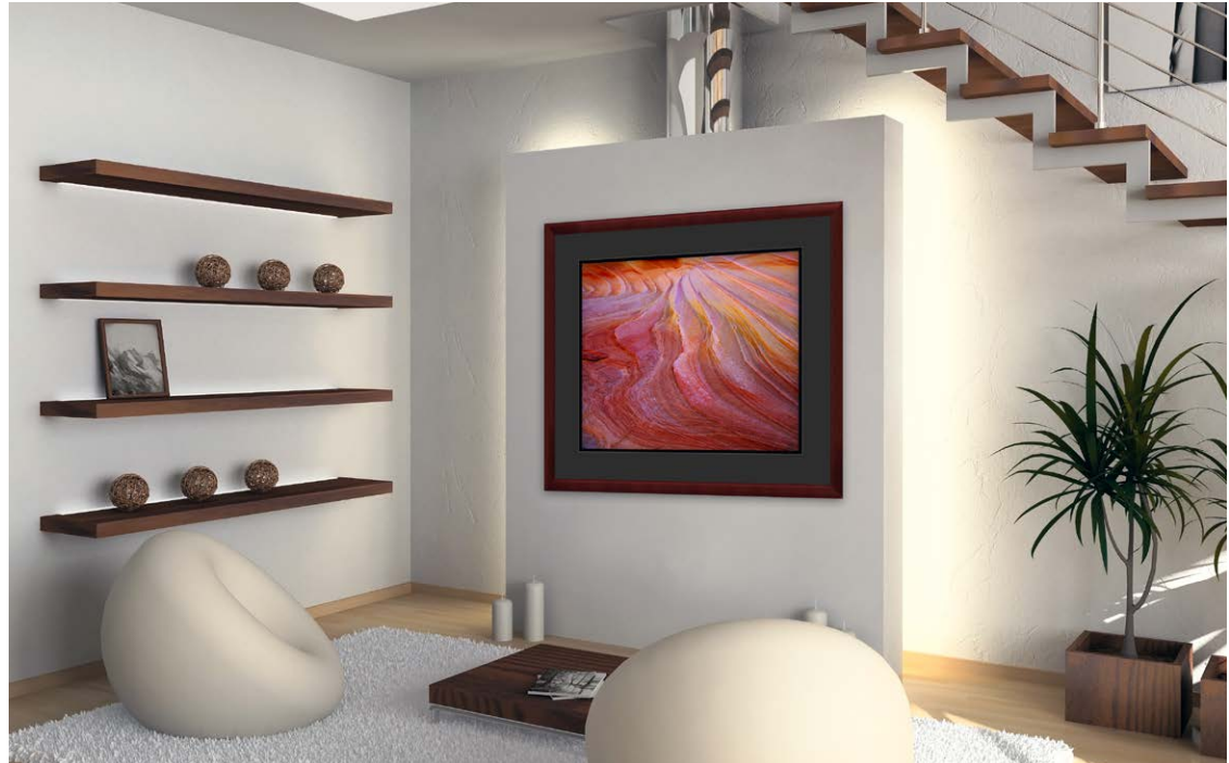
30x40 - Artist Series on Black Museum Board