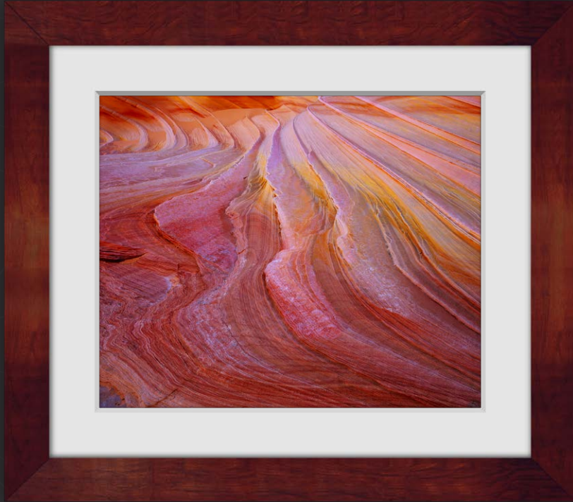
Della Terra: Cherry with White Linen