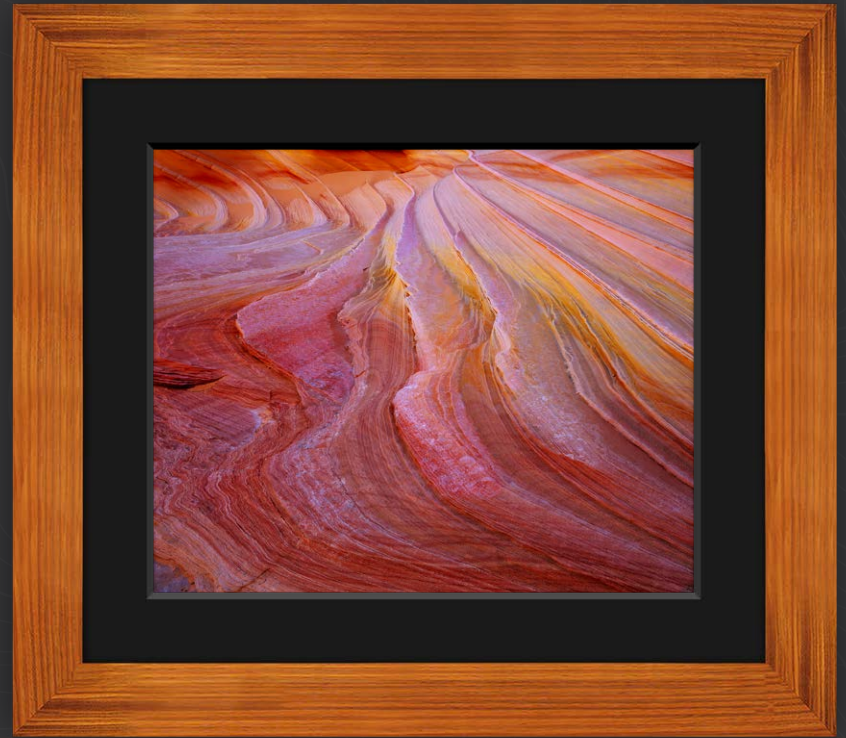
Koa with Black Linen