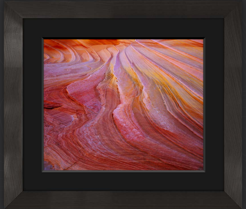
Della Terra: Charcoal with Black Linen