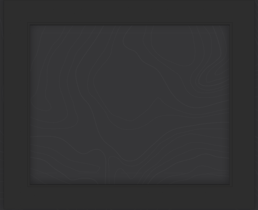
Black Museum Board