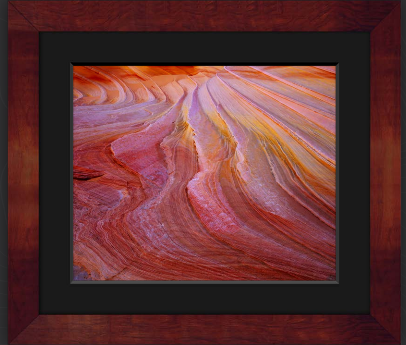
Della Terra: Cherry with Black Linen