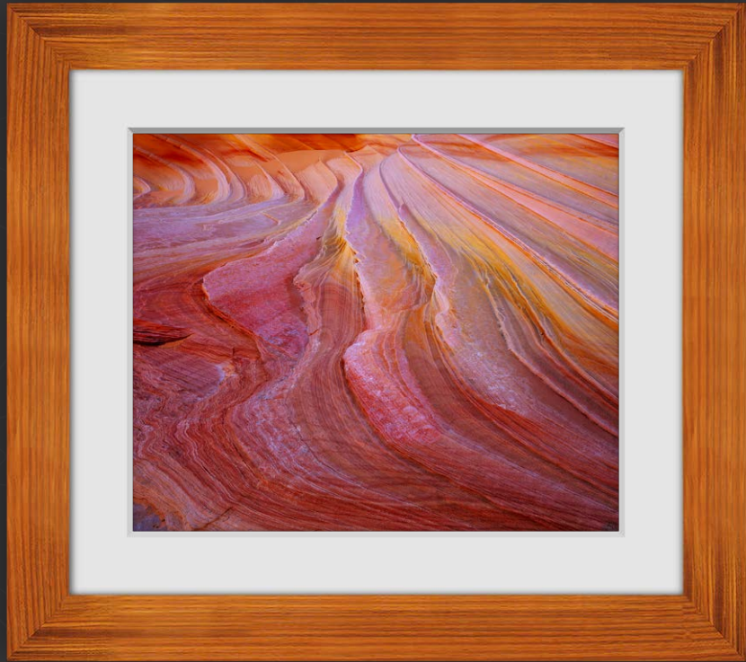
Koa with White Linen