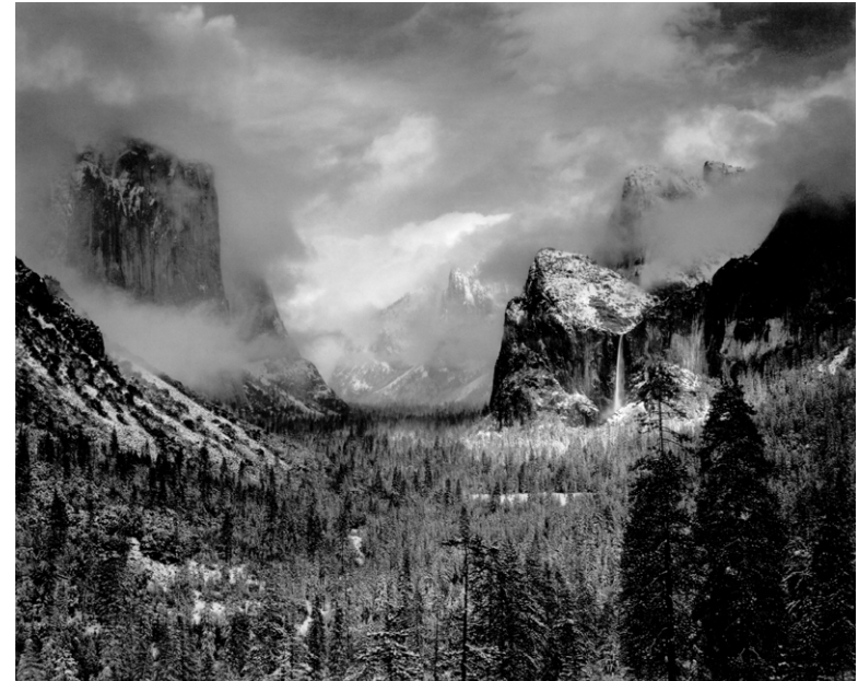
Clearing Winter Storm, Yosemite National Park Ansel Adams