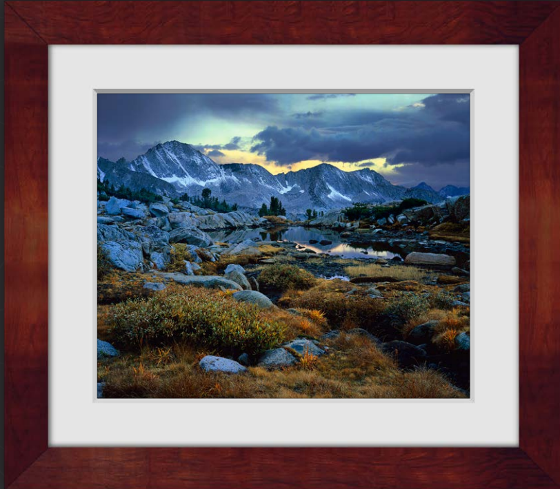
Della Terra: Cherry with White Linen