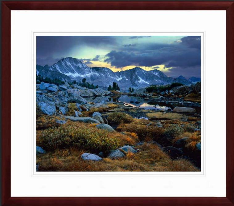
Artist Series: White Museum Board