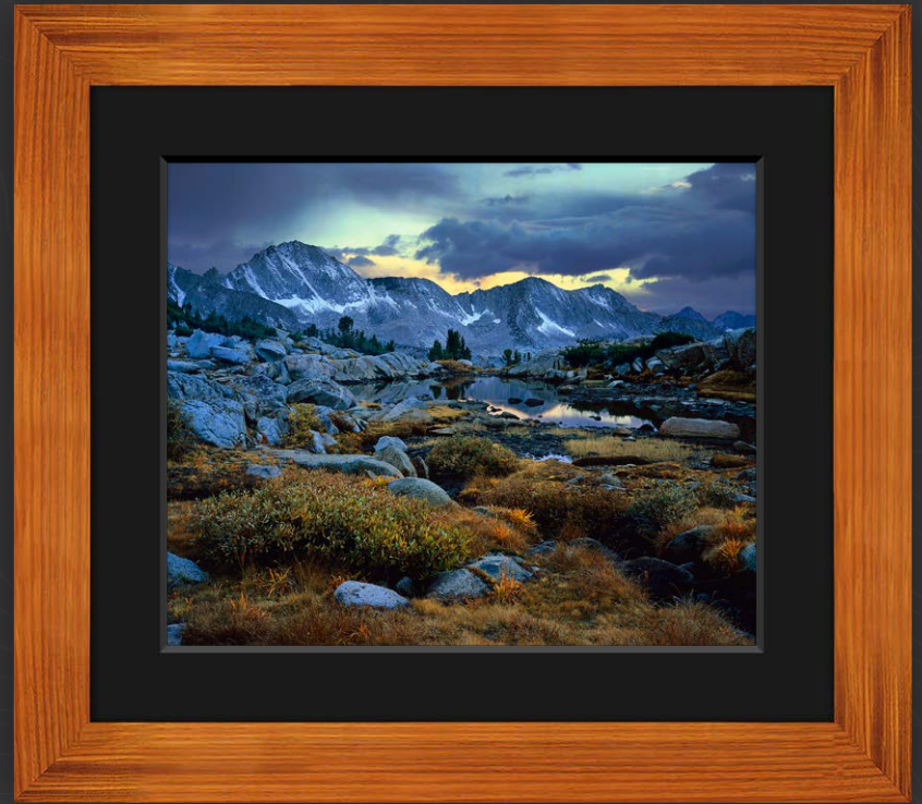
Koa with Black Linen