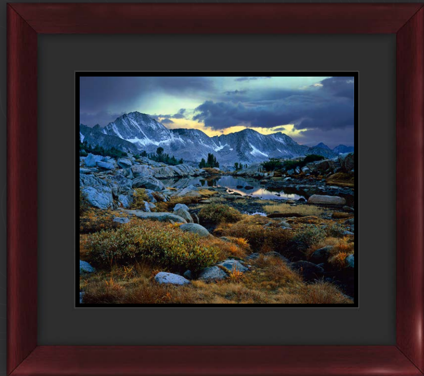
Large Artist Series: Black Museum Board