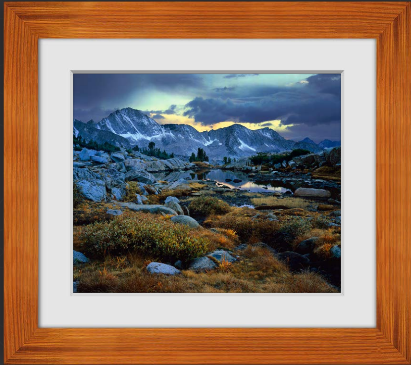
Koa with White Linen