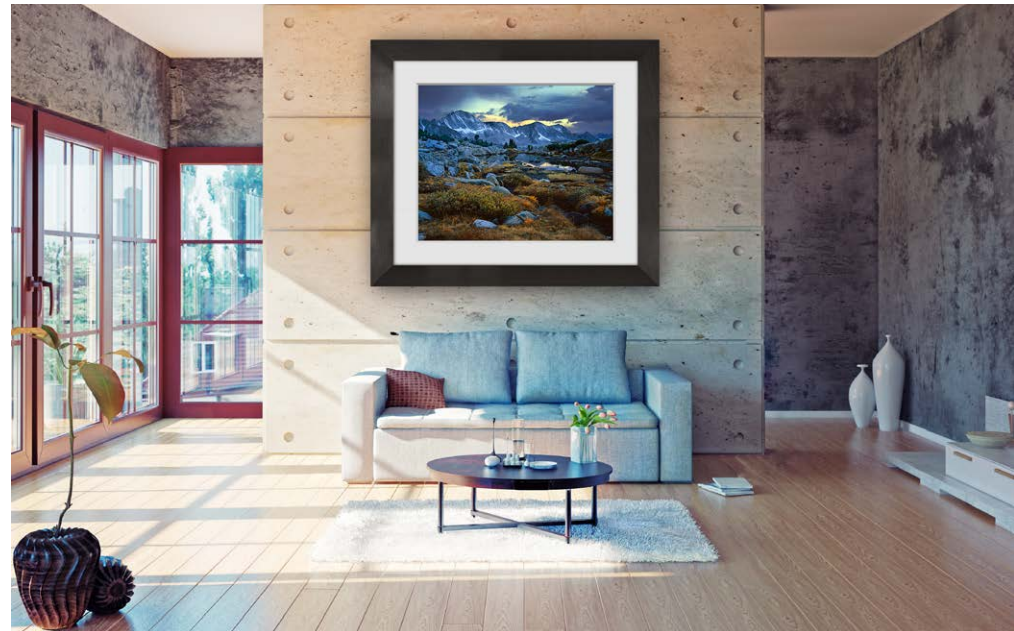
40x50 - Large Charcoal with White Linen

* Since Della Terra frames are made from sustainable forests, the trees are younger and therefore smaller. These smaller strips of veneer are applied to the frames, giving it the look of varied grain and stains - enhancing the beauty of the artwork it surrounds. Keep in mind if you see lines in the veneer, this is a natural characteristic of the wood due to the use of smaller, sustainably grown trees. These lines are not flaws. They are normal features of the materials and processes used in these high quality frames.