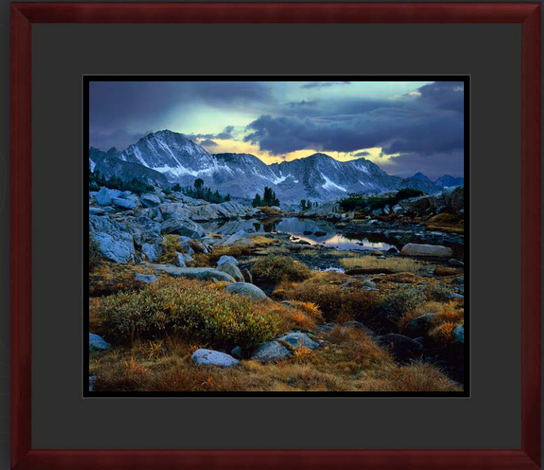
Artist Series: Black Museum Board