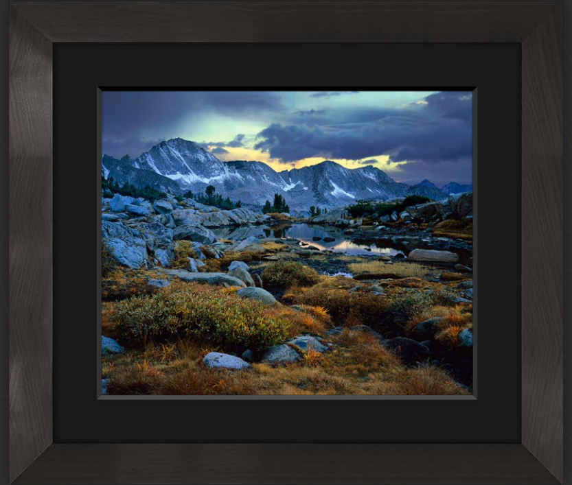
Della Terra: Charcoal with Black Linen