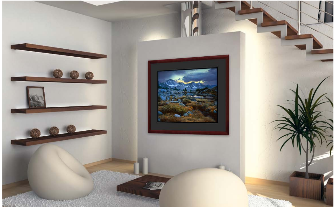
30x40 - Artist Series on Black Museum Board