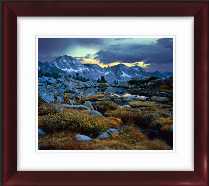
Large Artist Series: White Museum Board