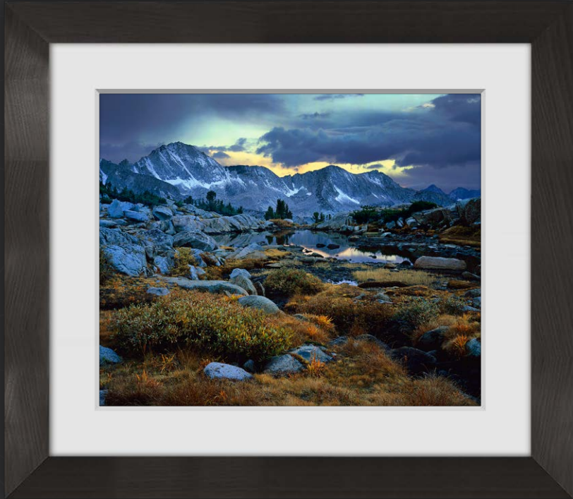
Della Terra: Charcoal with White Linen