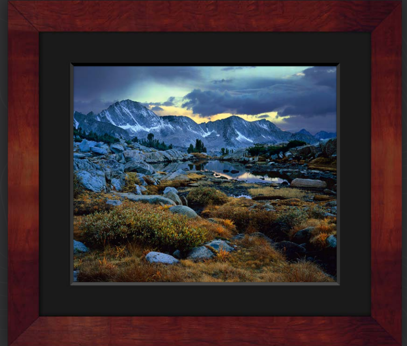
Della Terra: Cherry with Black Linen