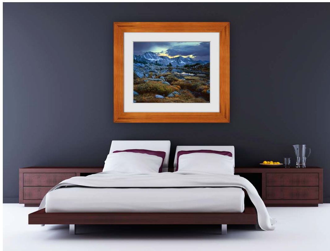
40x50 - Koa with White Linen

* Koa framing can be used on both Artist Series and Della Terra framing styles.