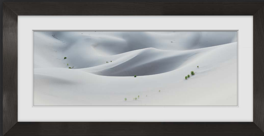
Della Terra: Charcoal with White Linen