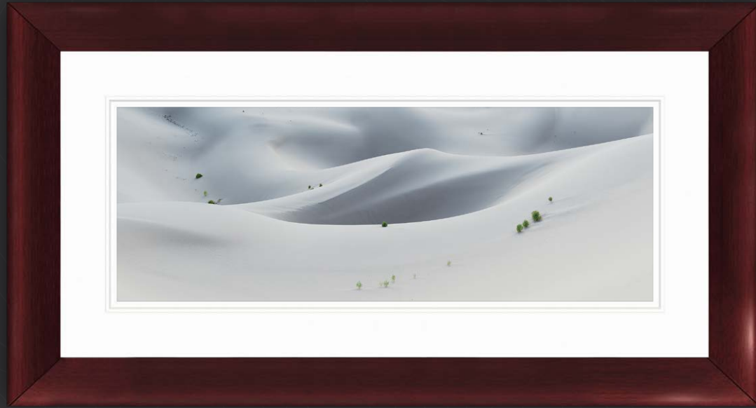
Large Artist Series: White Museum Board