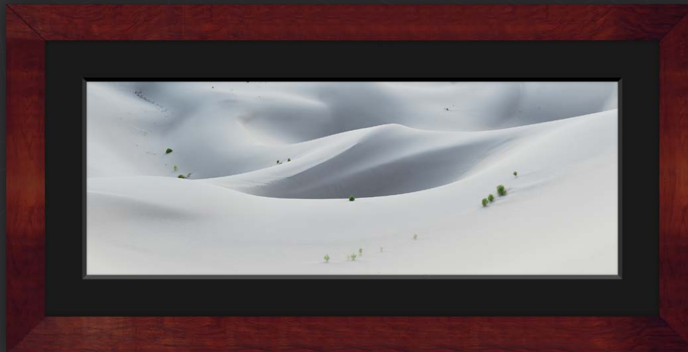
Della Terra: Cherry with Black Linen