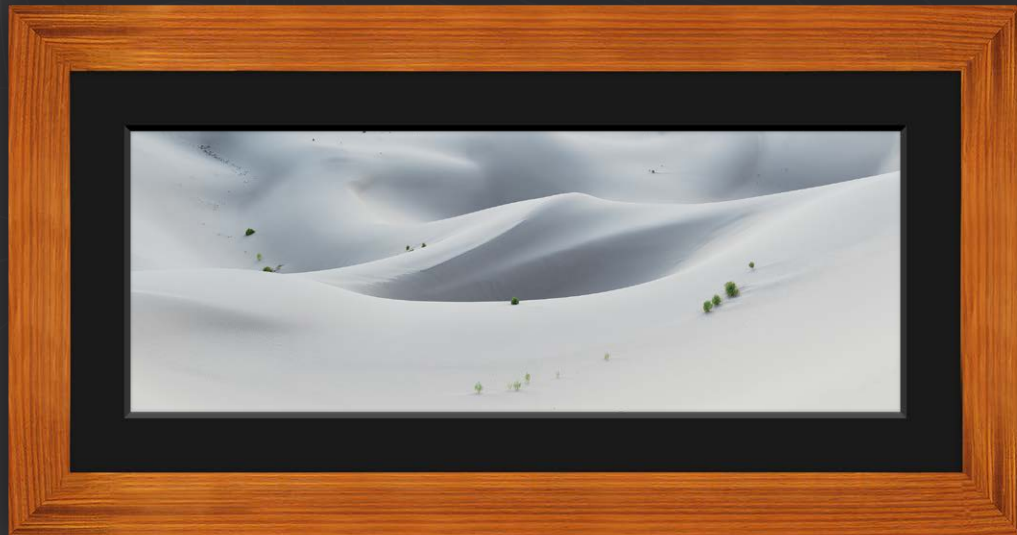
Koa with Black Linen