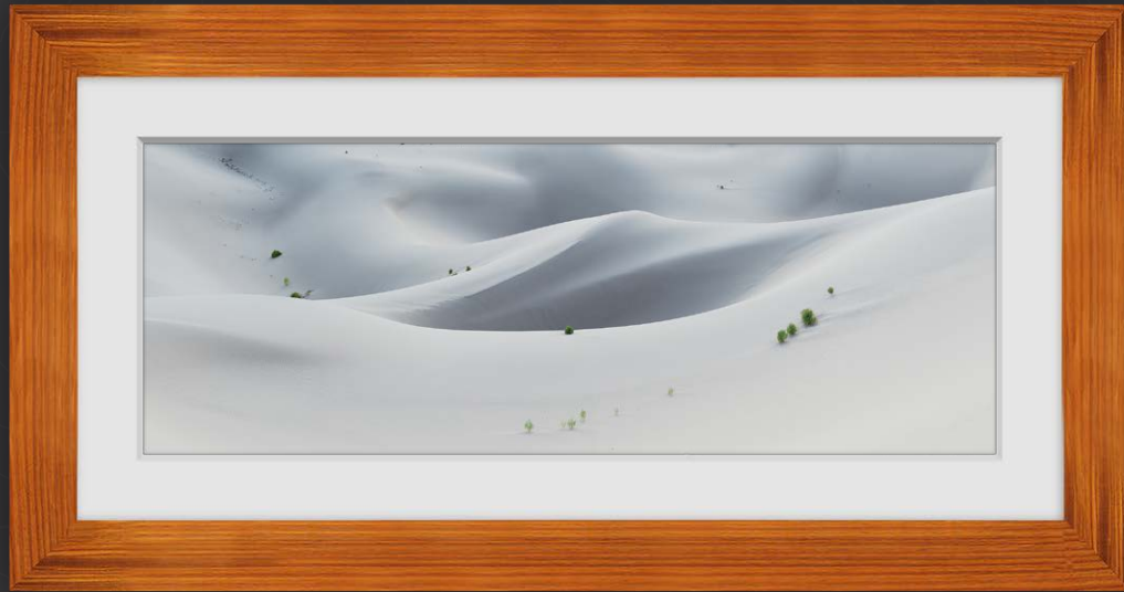
Koa with White Linen