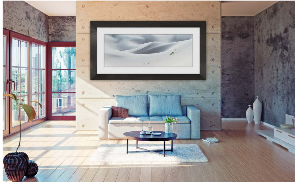
25x66 - Large Charcoal with White Linen

* Since Della Terra frames are made from sustainable forests, the trees are younger and therefore smaller. These smaller strips of veneer are applied to the frames, giving it the look of varied grain and stains - enhancing the beauty of the artwork it surrounds. Keep in mind if you see lines in the veneer, this is a natural characteristic of the wood due to the use of smaller, sustainably grown trees. These lines are not flaws. They are normal features of the materials and processes used in these high quality frames.