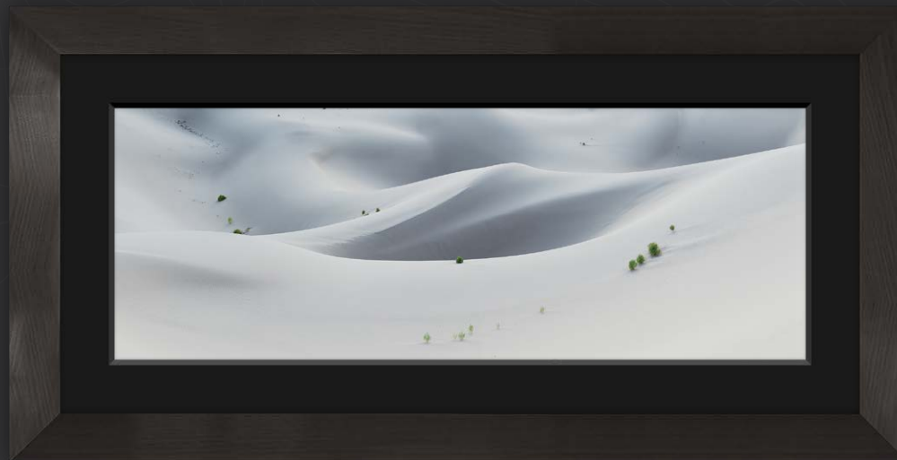
Della Terra: Charcoal with Black Linen