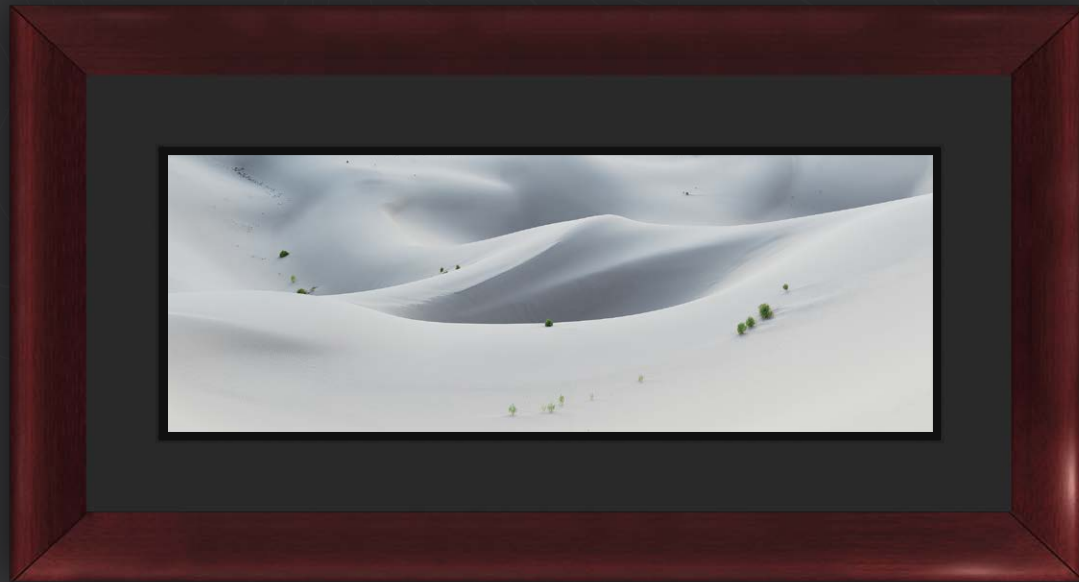
Large Artist Series: Black Museum Board