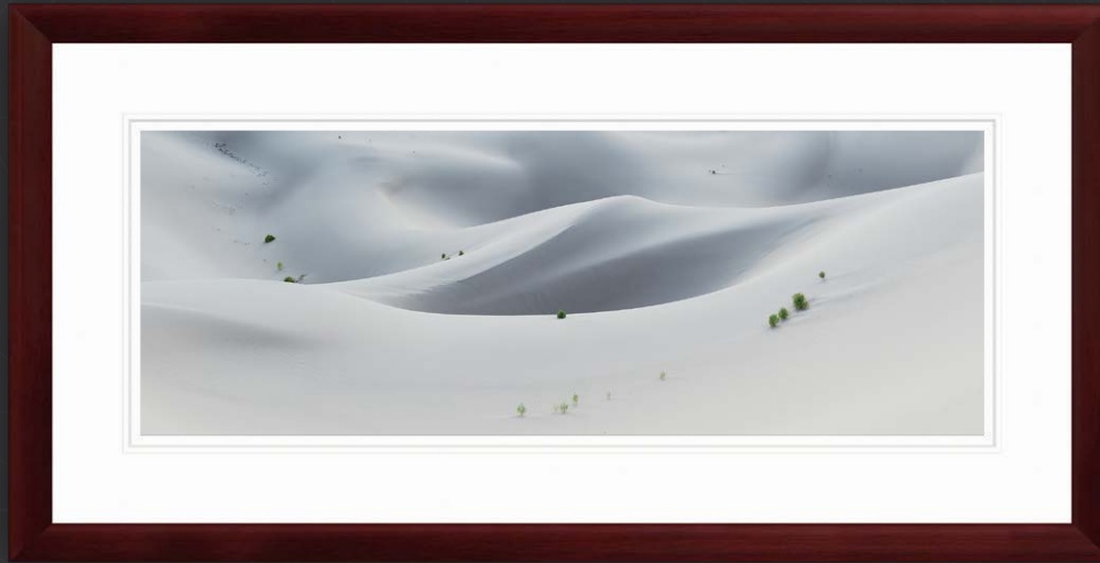
Artist Series: White Museum Board