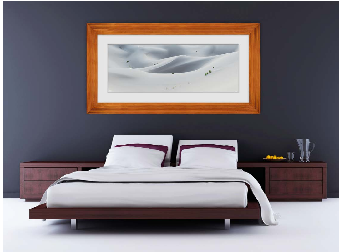
25x66 - Koa with White Linen

* Koa framing can be used on both Artist Series and Della Terra framing styles.