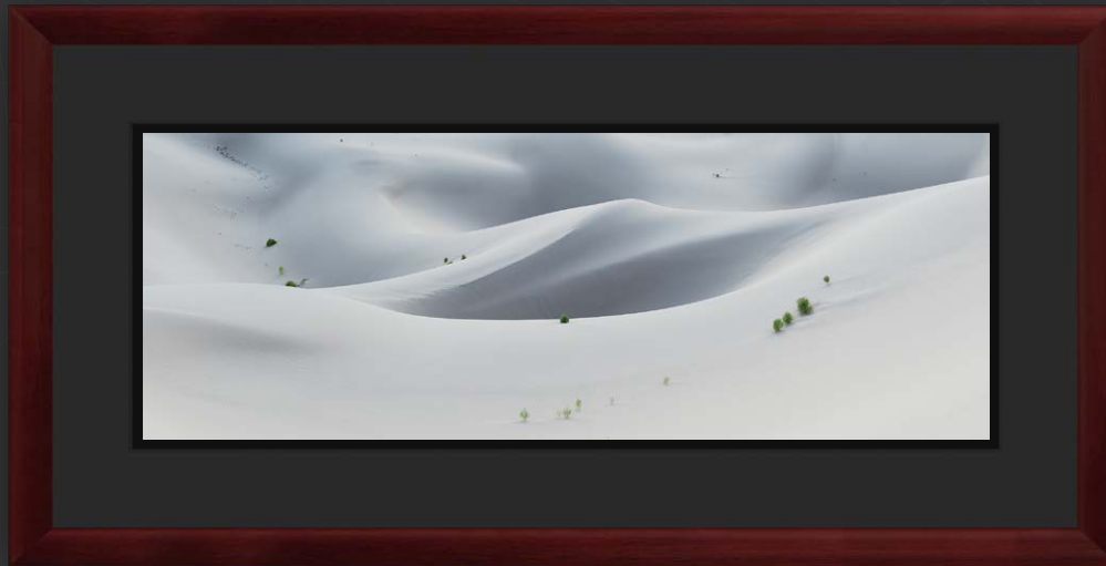
Artist Series: Black Museum Board