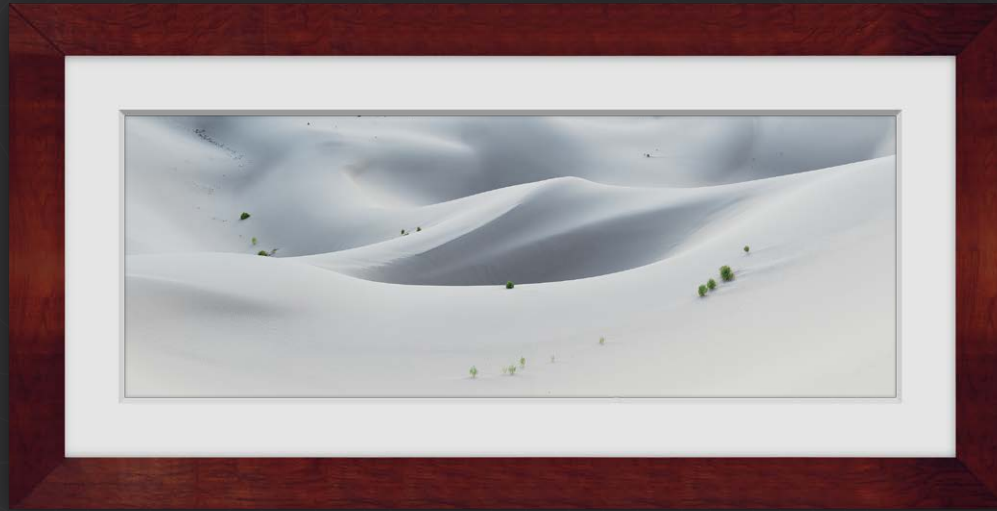
Della Terra: Cherry with White Linen