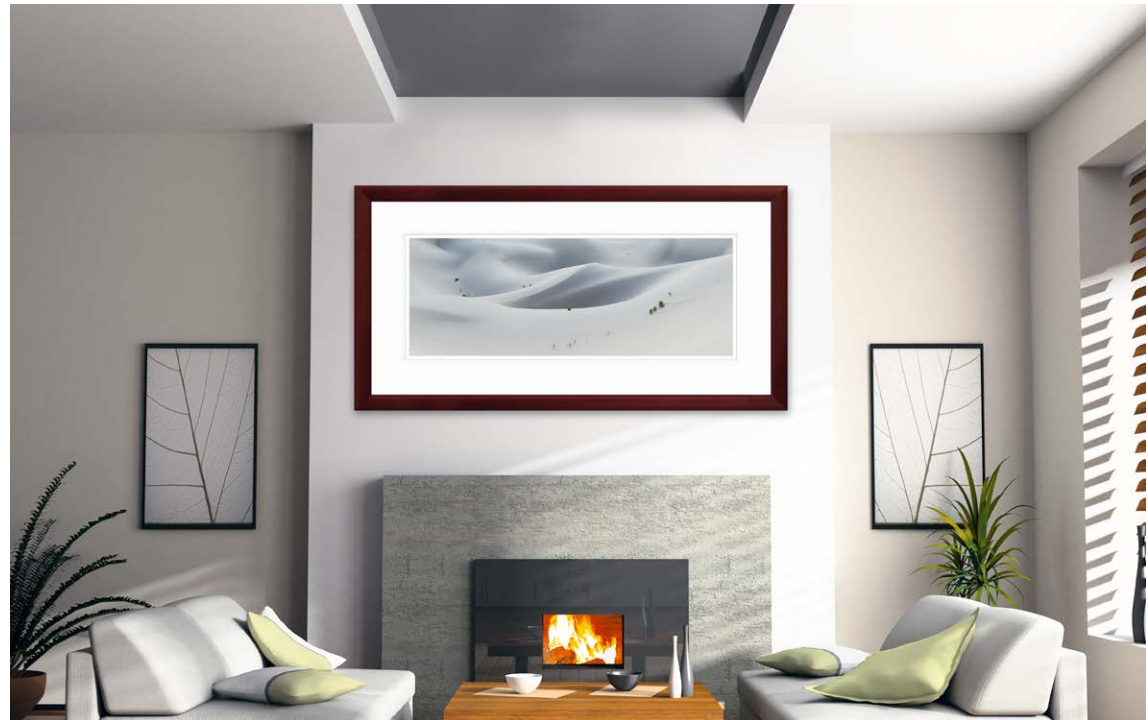
15x40 - Artist Series on White Museum Board