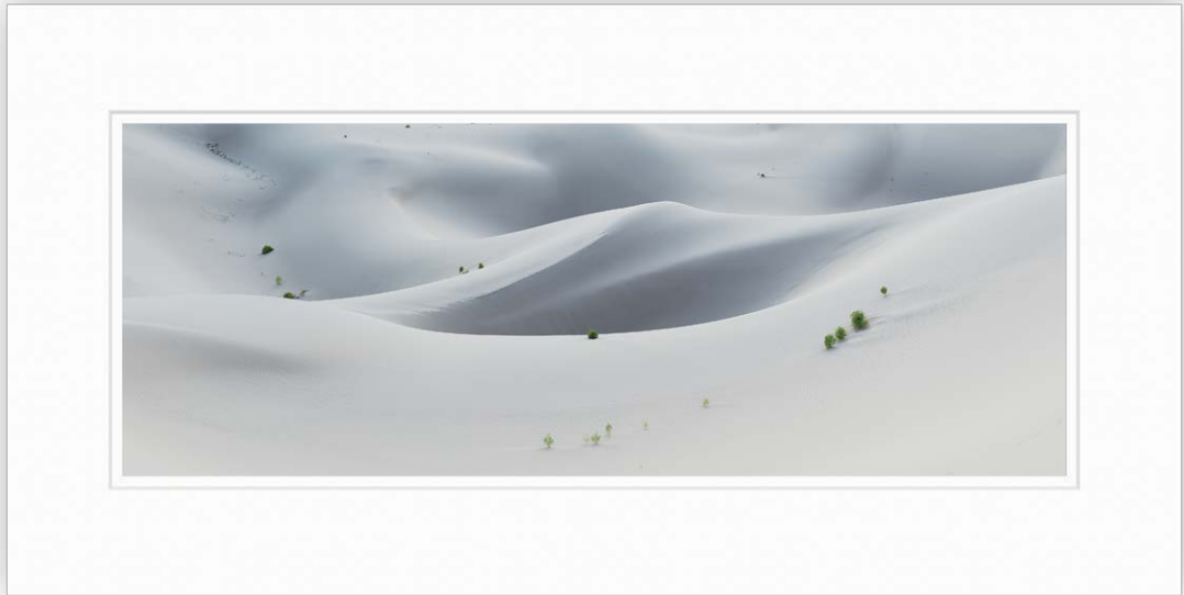
Single 8 ply matte

We offer only one type of matting for our Fine Art Photographs: Crescent museum board, in a combination of 8 ply, double 8 ply and/or 4 ply. This cotton museum board was designed specifically for the Metropolitan Museum of Art in the late 1920s, and now is used in almost all museums and libraries worldwide. All of our museum boards are 100-percent cotton. This ensures an entirely acid-free and PH balanced environment for your Fine Art Photograph, allowing for year after year of carefree enjoyment. The museum board is sized to your image perfectly and features a traditional beveled cut. You can choose between two classics: black or white. Both look fantastic.