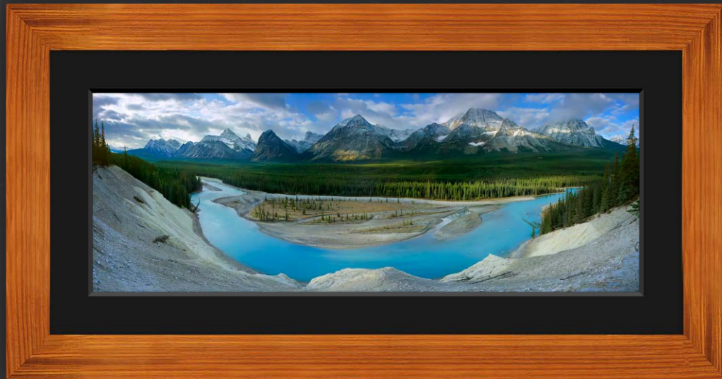
Koa with Black Linen