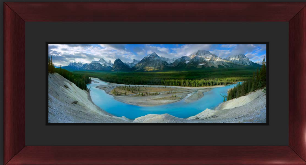
Large Artist Series: Black Museum Board