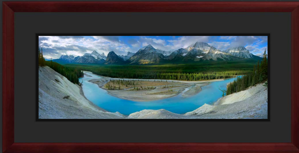
Artist Series: Black Museum Board