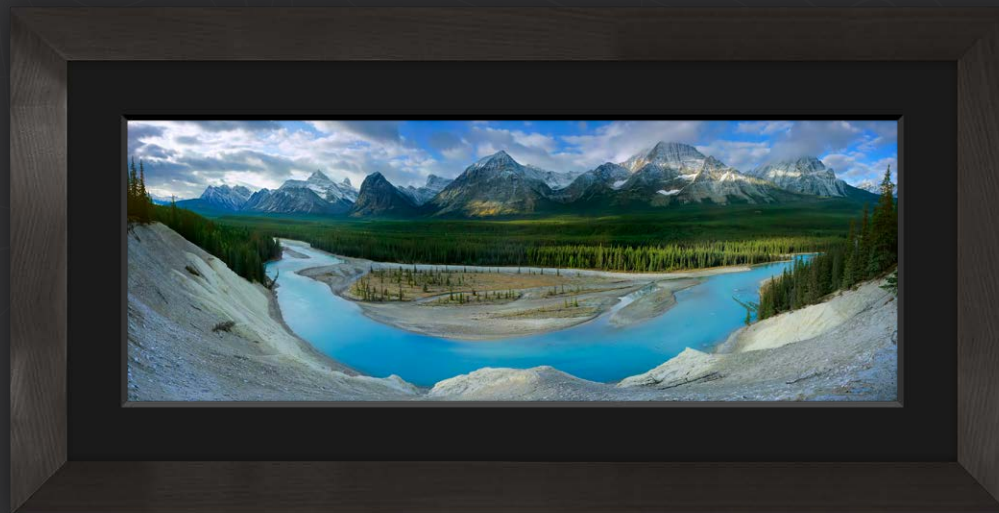
Della Terra: Charcoal with Black Linen