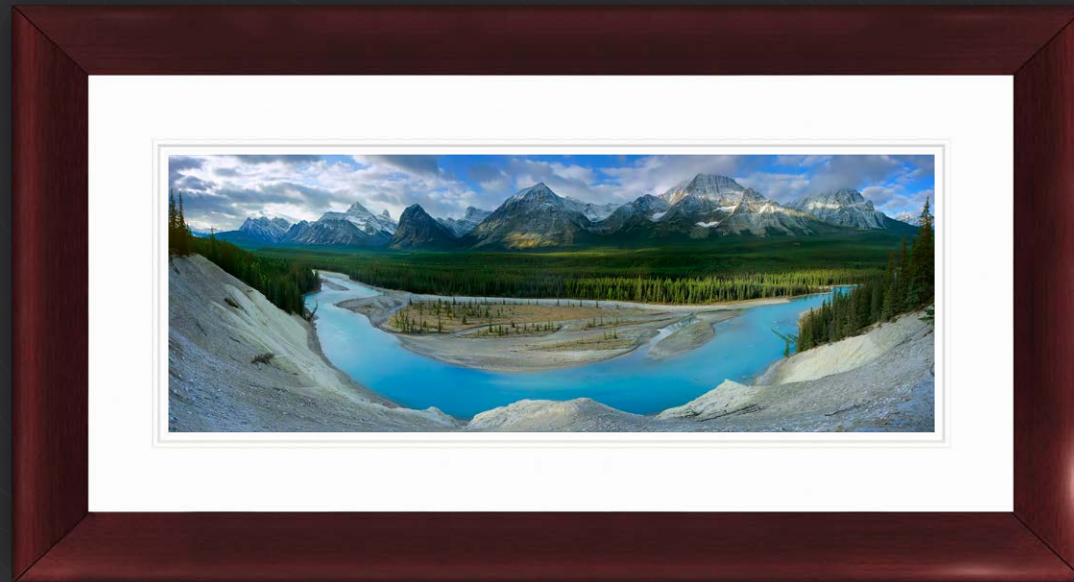
Large Artist Series: White Museum Board