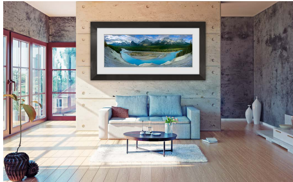
25x66 - Large Charcoal with White Linen

* Since Della Terra frames are made from sustainable forests, the trees are younger and therefore smaller. These smaller strips of veneer are applied to the frames, giving it the look of varied grain and stains - enhancing the beauty of the artwork it surrounds. Keep in mind if you see lines in the veneer, this is a natural characteristic of the wood due to the use of smaller, sustainably grown trees. These lines are not flaws. They are normal features of the materials and processes used in these high quality frames.