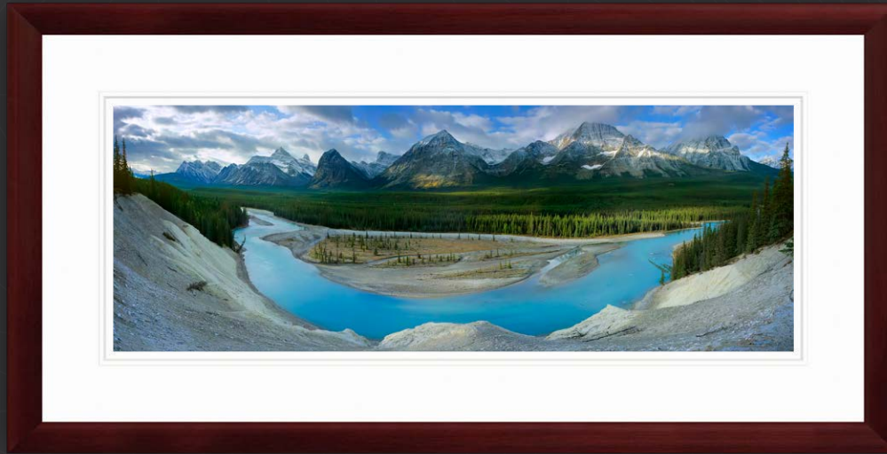
Artist Series: White Museum Board