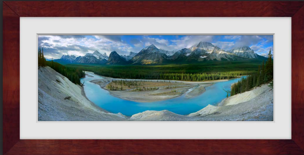
Della Terra: Cherry with White Linen