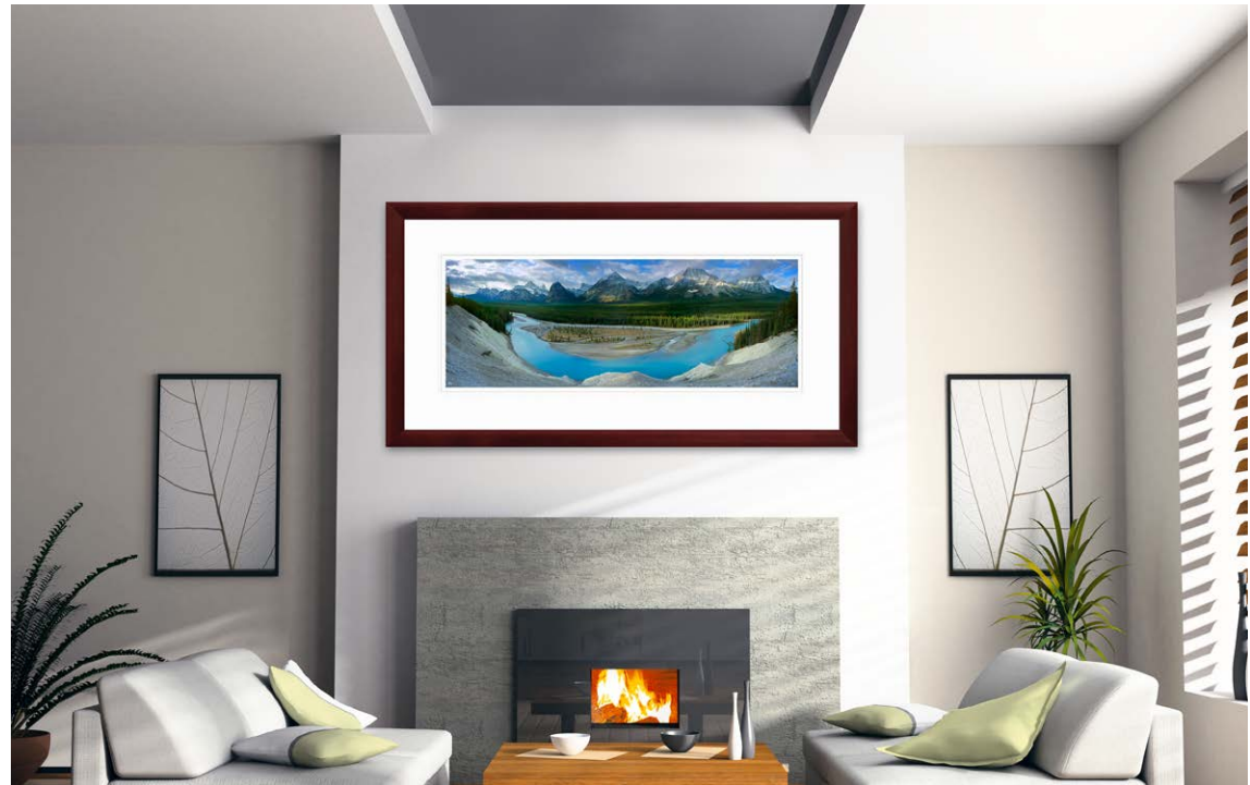
15x40 - Artist Series on White Museum Board