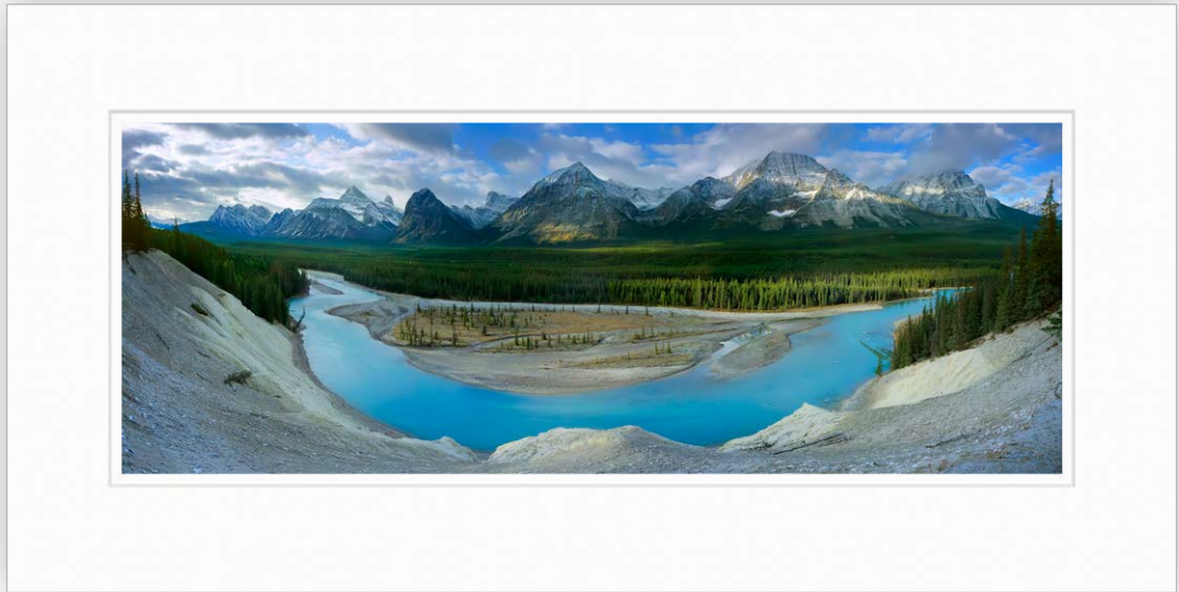
Single 8 ply matte

We offer only one type of matting for our Fine Art Photographs: Crescent museum board, in a combination of 8 ply, double 8 ply and/or 4 ply. This cotton museum board was designed specifically for the Metropolitan Museum of Art in the late 1920s, and now is used in almost all museums and libraries worldwide. All of our museum boards are 100-percent cotton. This ensures an entirely acid-free and PH balanced environment for your Fine Art Photograph, allowing for year after year of carefree enjoyment. The museum board is sized to your image perfectly and features a traditional beveled cut. You can choose between two classics: black or white. Both look fantastic.