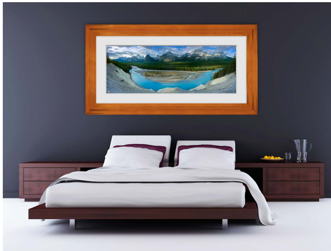
25x66 - Koa with White Linen

* Koa framing can be used on both Artist Series and Della Terra framing styles.