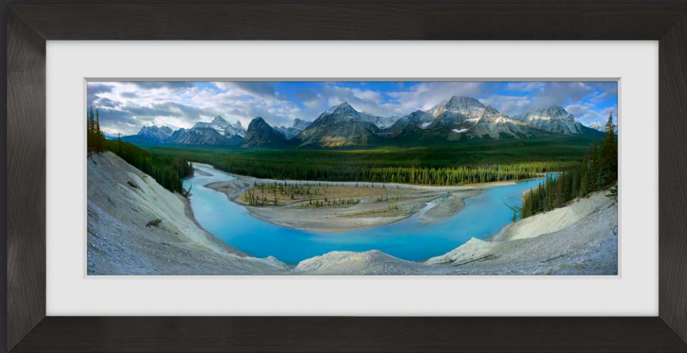
Della Terra: Charcoal with White Linen