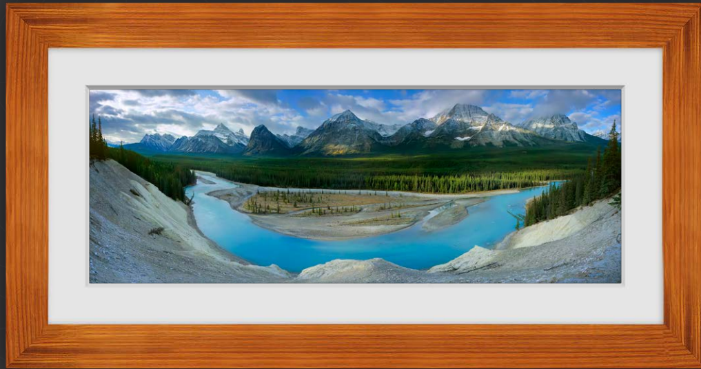
Koa with White Linen