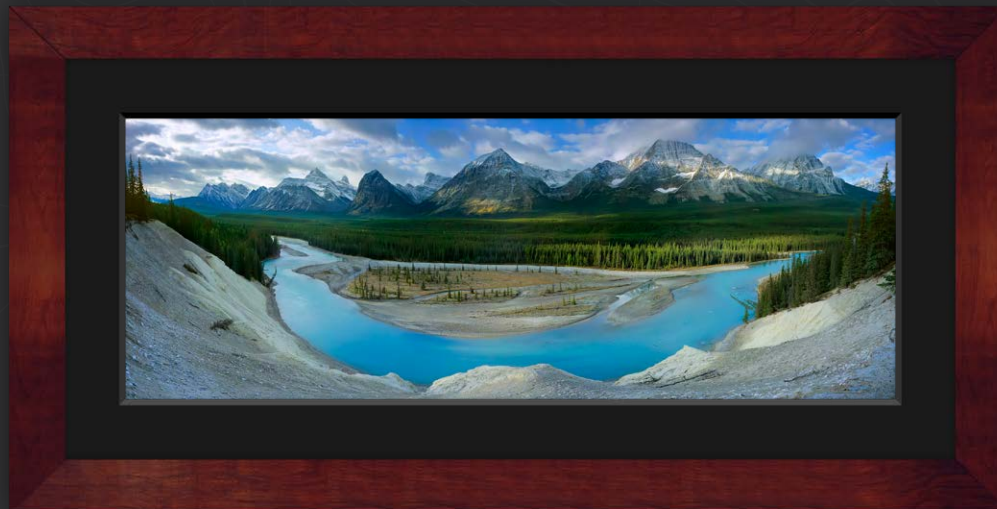
Della Terra: Cherry with Black Linen