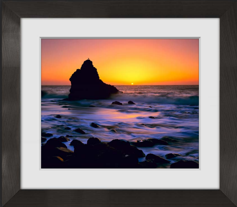
Della Terra: Charcoal with White Linen