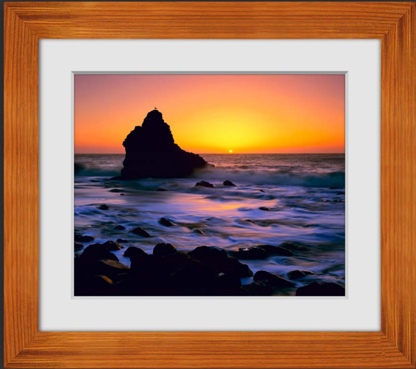
Koa with White Linen