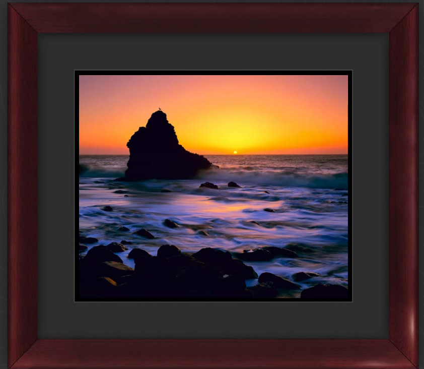
Large Artist Series: Black Museum Board