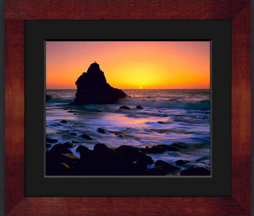
Della Terra: Cherry with Black Linen