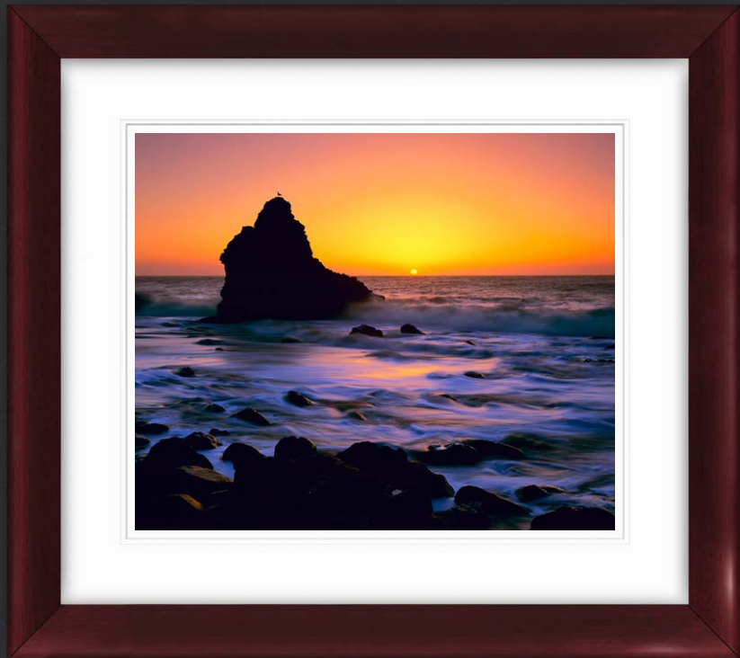
Large Artist Series: White Museum Board