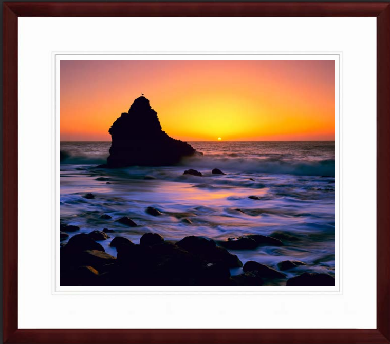
Artist Series: White Museum Board