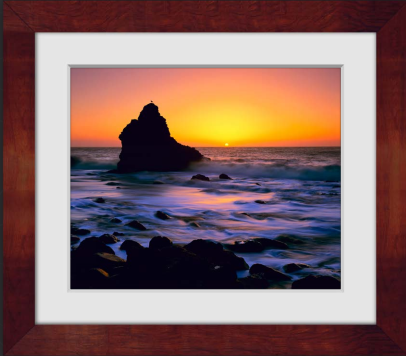
Della Terra: Cherry with White Linen