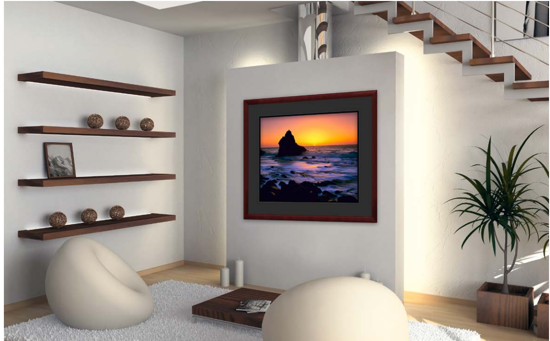
30x40 - Artist Series on Black Museum Board