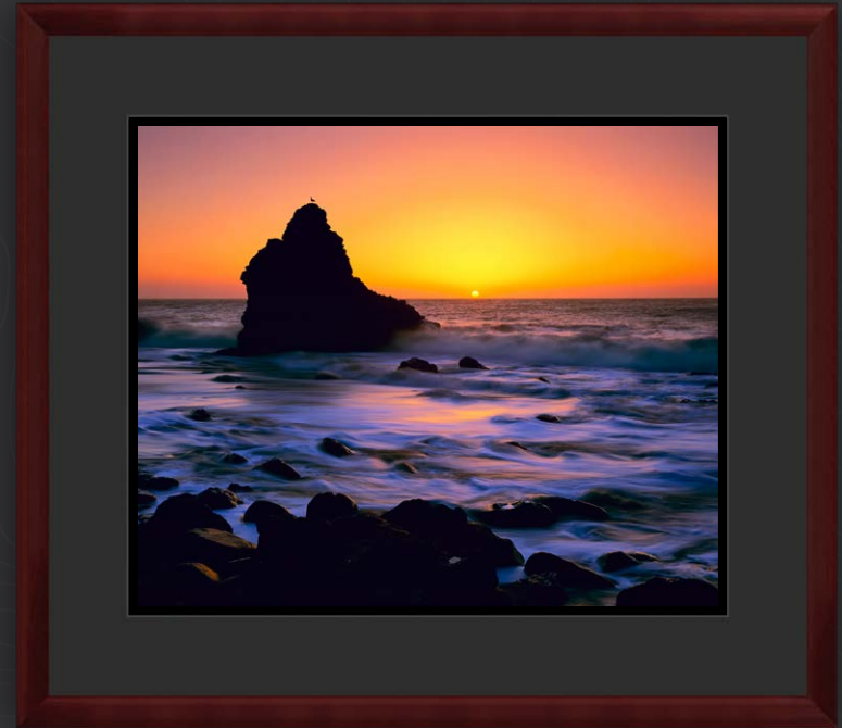
Artist Series: Black Museum Board