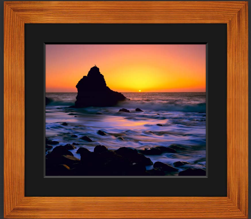
Koa with Black Linen