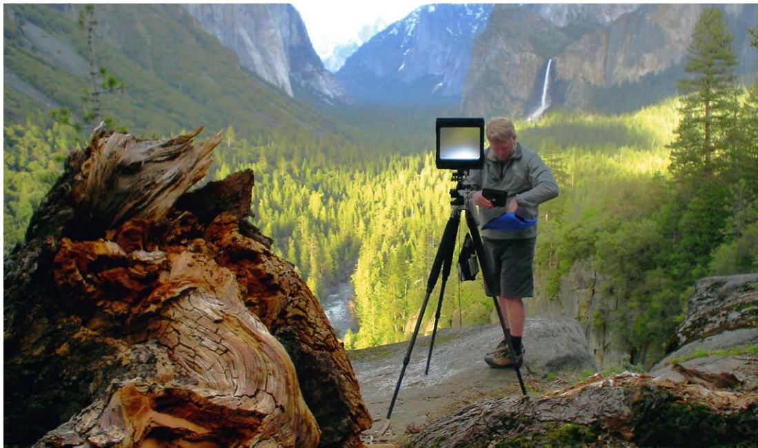
Yosemite National Park California, USA