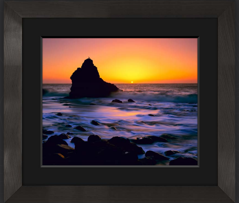
Della Terra: Charcoal with Black Linen