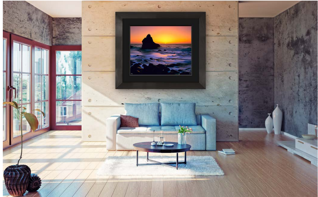
40x50 - Large Charcoal with Black Linen

We often get asked where we come up with some of these names. In this case it was easy. Della Terra is Italian for "From the Earth." What more do we need to say? It's the perfect description for this wonderful style. Each piece is hand fitted with a very high end tightly woven fabric wrap, in either black or white. Rodney has personally picked out several frame options that work phenomenally well with this style: Walnut, Charcoal and Cherry. Each is hand crafted in and imported from Italy, and are sourced from sustainable forestry programs. All you have to do is pick which frame and linen works best for you - because Rodney already knows that they will look great together!