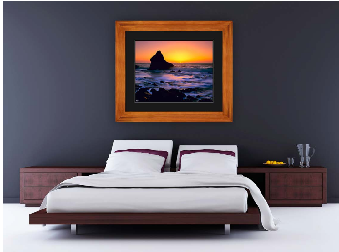
40x50 - Koa with Black Linen

* Koa framing can be used on both Artist Series and Della Terra framing styles.