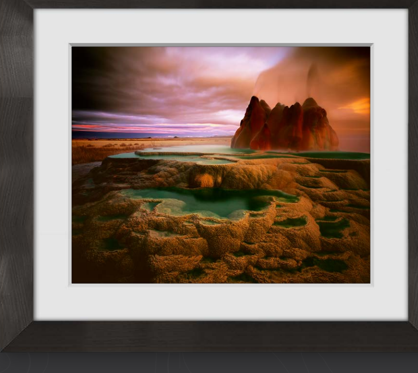
Della Terra: Charcoal with White Linen