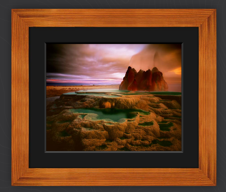
Koa with Black Linen