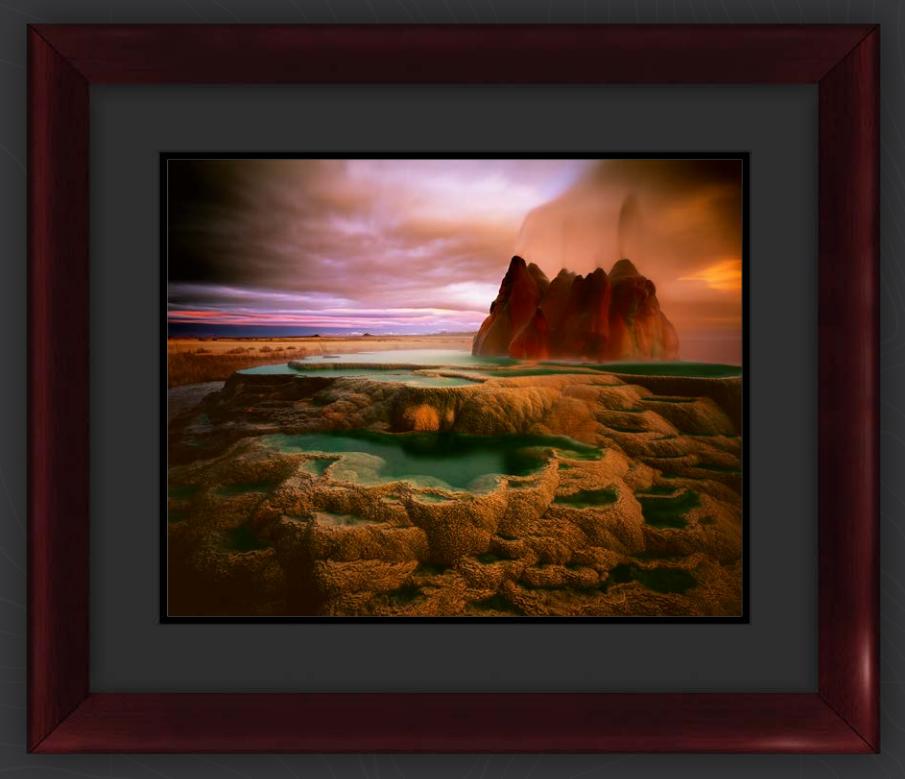
_arge Artist Series: Black Museum Board