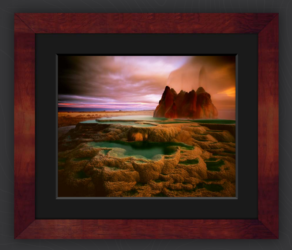
Della Terra: Cherry with Black Linen