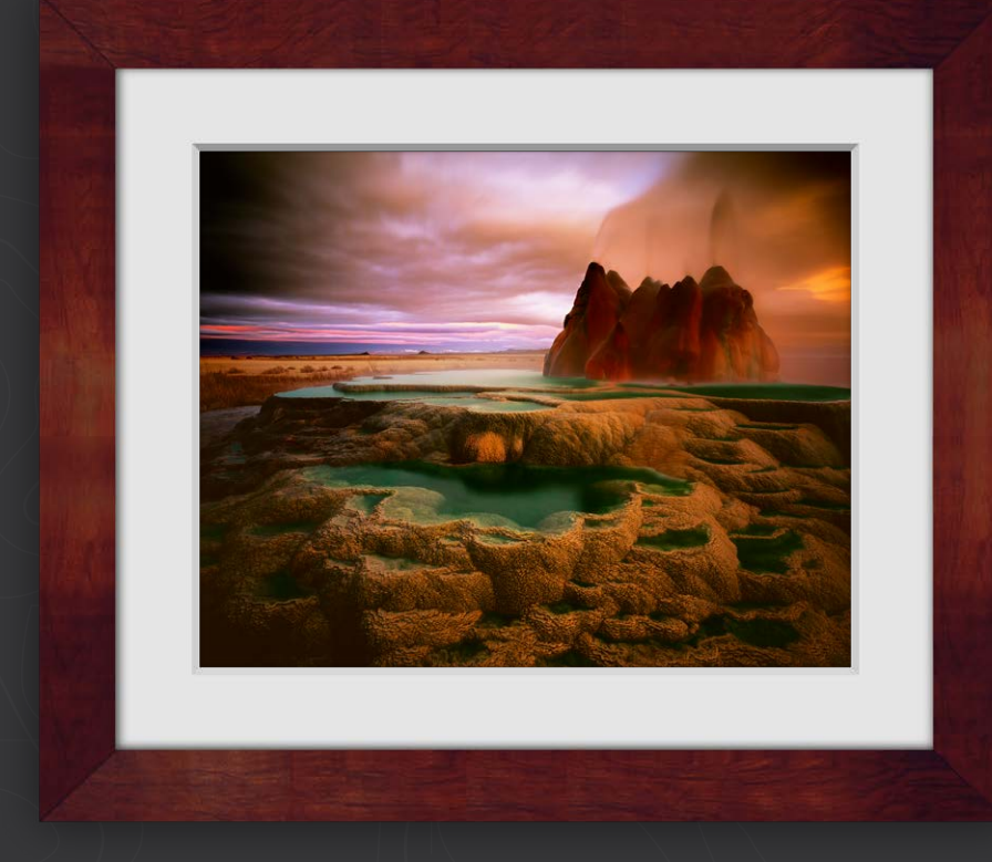
Della Terra: Cherry with White Linen