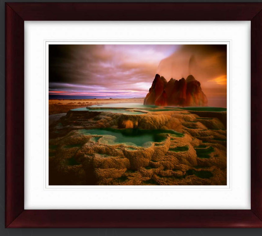
_arge Artist Series: White Museum Board