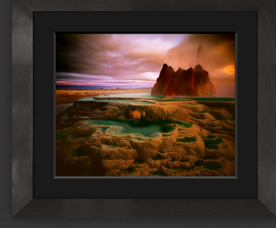
Della Terra: Charcoal with Black Linen