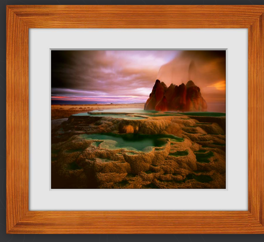
Koa with White Linen