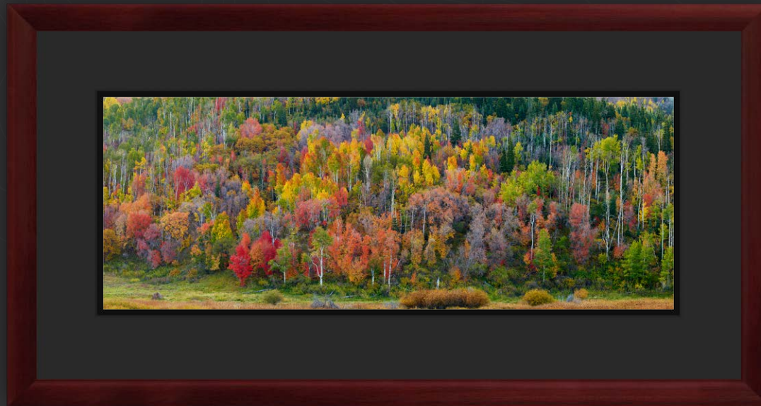
Artist Series: Black Museum Board