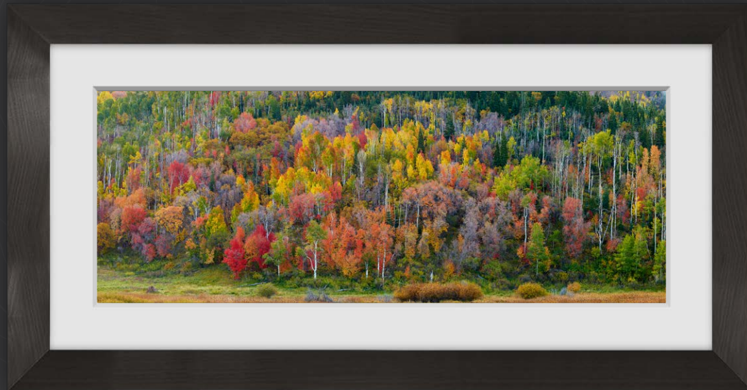
Della Terra: Charcoal with White Linen