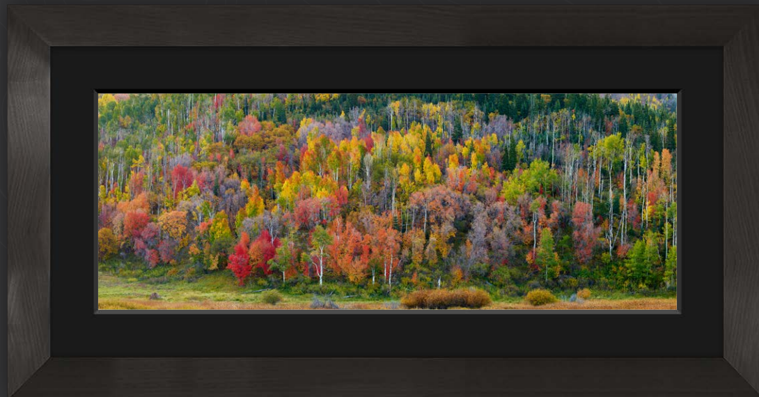
Della Terra: Charcoal with Black Linen