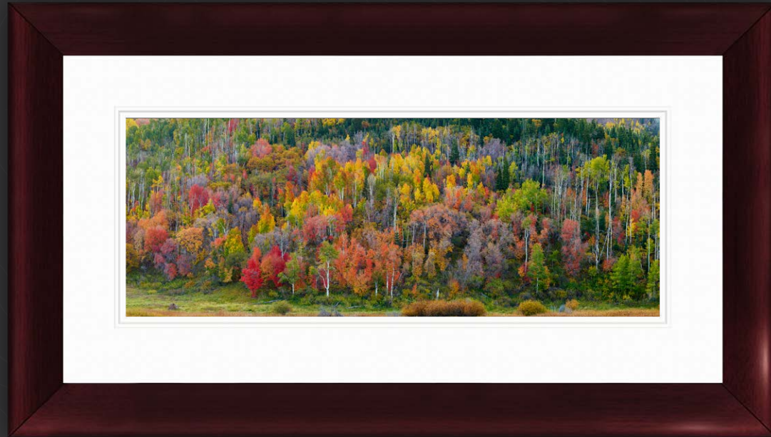
Large Artist Series: White Museum Board