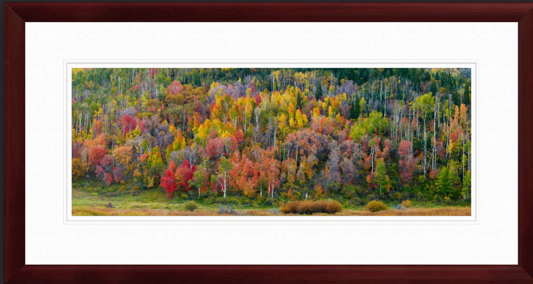
Artist Series: White Museum Board