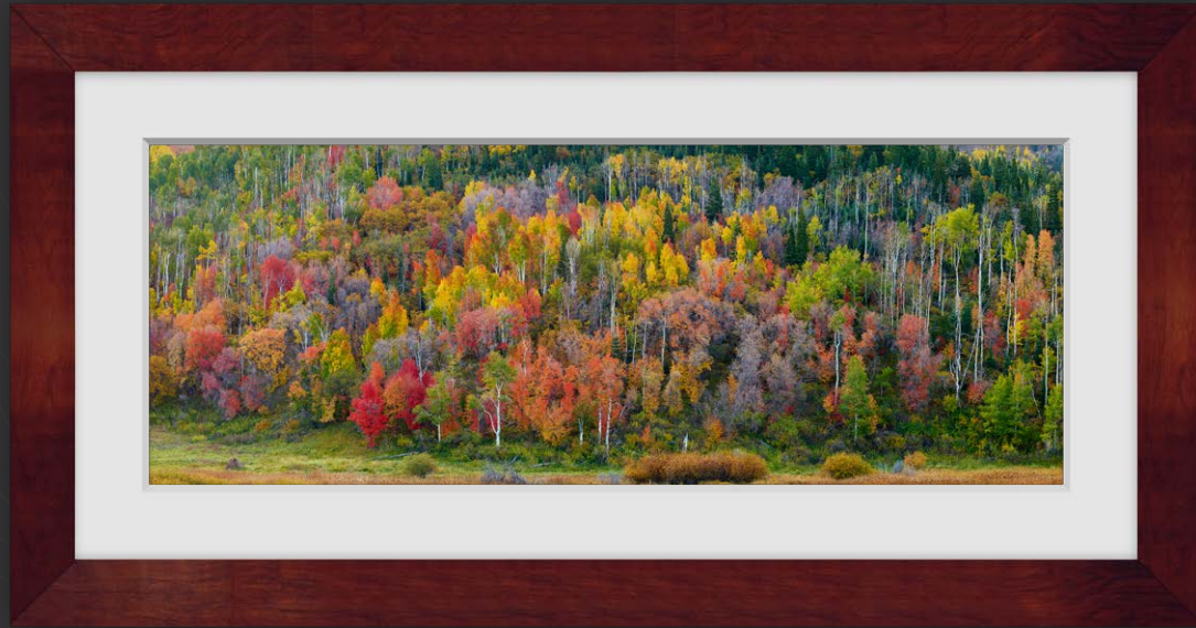
Della Terra: Cherry with White Linen