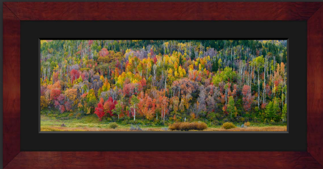
Della Terra: Cherry with Black Linen