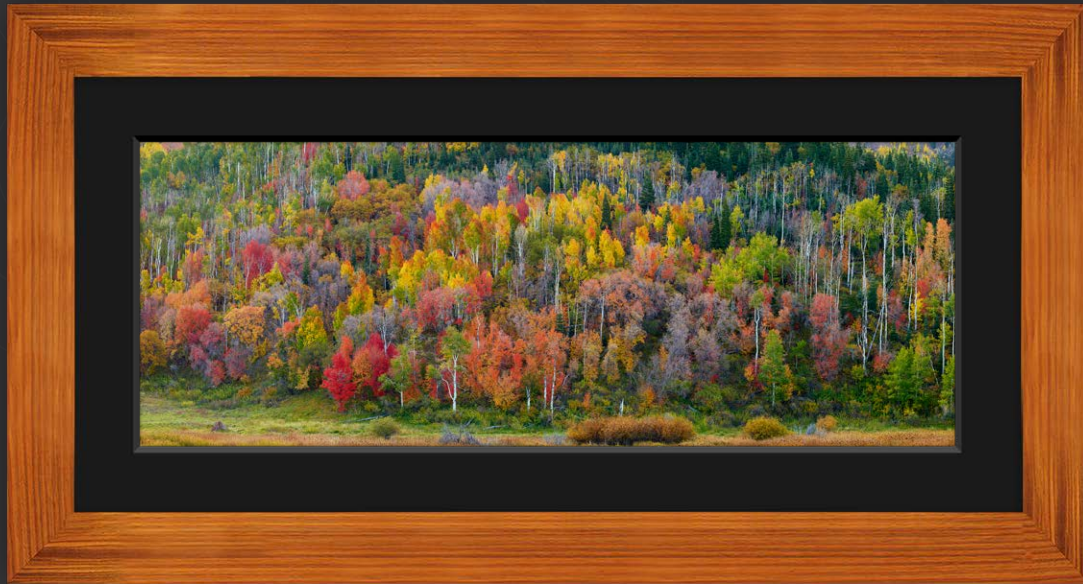
Koa with Black Linen