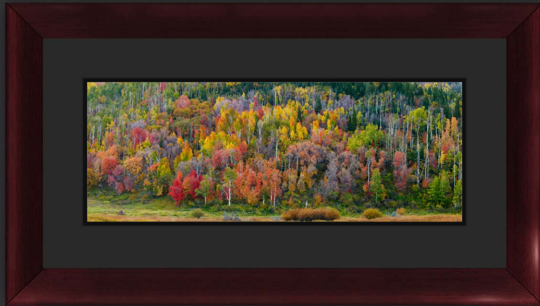
Large Artist Series: Black Museum Board