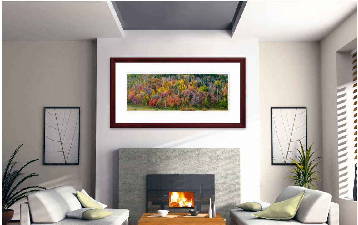
15x40 - Artist Series on White Museum Board