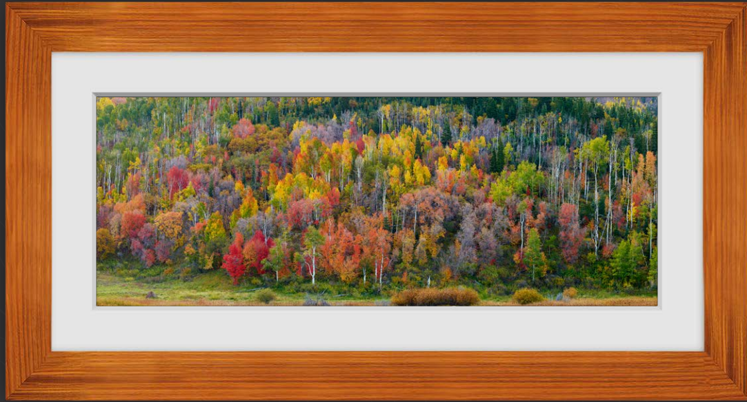
Koa with White Linen