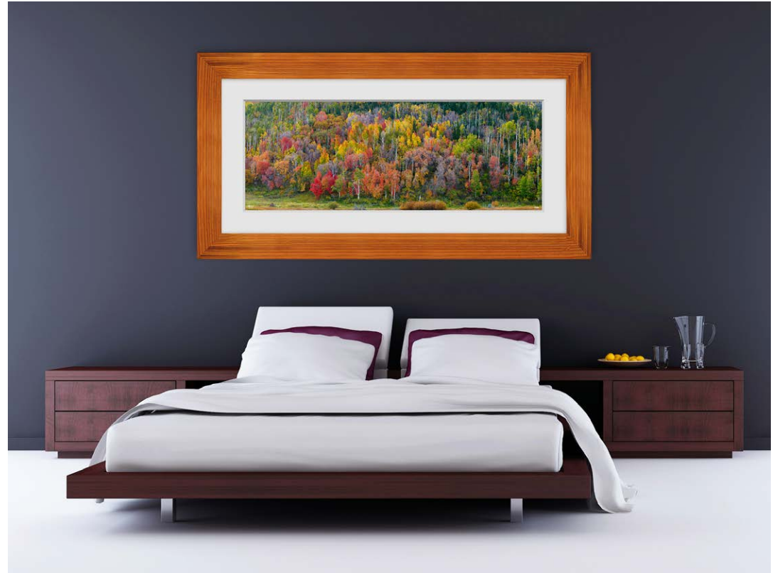
25x66 - Koa with White Linen

* Koa framing can be used on both Artist Series and Della Terra framing styles.