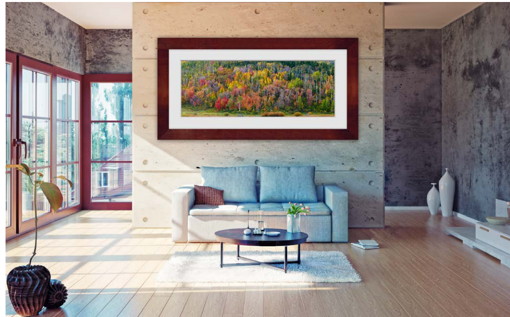
25x66 - Large Cherry with White Linen

* Since Della Terra frames are made from sustainable forests, the trees are younger and therefore smaller. These smaller strips of veneer are applied to the frames, giving it the look of varied grain and stains - enhancing the beauty of the artwork it surrounds. Keep in mind if you see lines in the veneer, this is a natural characteristic of the wood due to the use of smaller, sustainably grown trees. These lines are not flaws. They are normal features of the materials and processes used in these high quality frames.