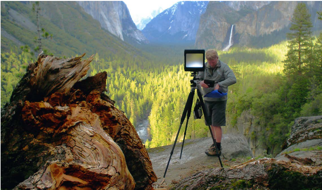
Yosemite National Park California, USA