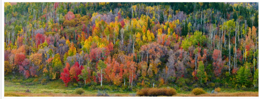
Single 8 ply matte

We offer only one type of matting for our Fine Art Photographs: Crescent museum board, in a combination of 8 ply, double 8 ply and/or 4 ply. This cotton museum board was designed specifically for the Metropolitan Museum of Art in the late 1920s, and now is used in almost all museums and libraries worldwide. All of our museum boards are 100-percent cotton. This ensures an entirely acid-free and PH balanced environment for your Fine Art Photograph, allowing for year after year of carefree enjoyment. The museum board is sized to your image perfectly and features a traditional beveled cut. You can choose between two classics: black or white. Both look fantastic.