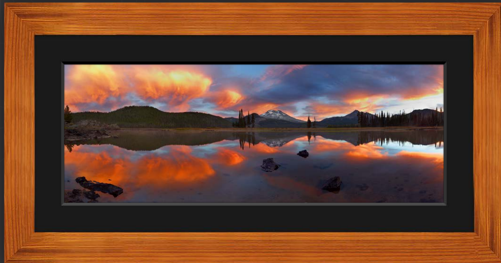
Koa with Black Linen