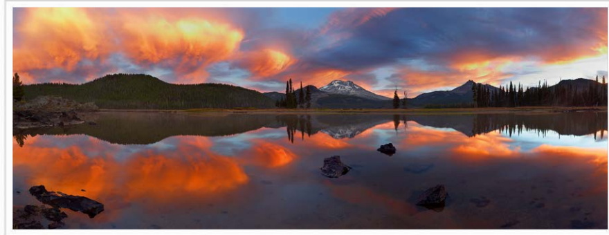
Single 8 ply matte

We offer only one type of matting for our Fine Art Photographs: Crescent museum board, in a combination of 8 ply, double 8 ply and/or 4 ply. This cotton museum board was designed specifically for the Metropolitan Museum of Art in the late 1920s, and now is used in almost all museums and libraries worldwide. All of our museum boards are 100-percent cotton. This ensures an entirely acid-free and PH balanced environment for your Fine Art Photograph, allowing for year after year of carefree enjoyment. The museum board is sized to your image perfectly and features a traditional beveled cut. You can choose between two classics: black or white. Both look fantastic.