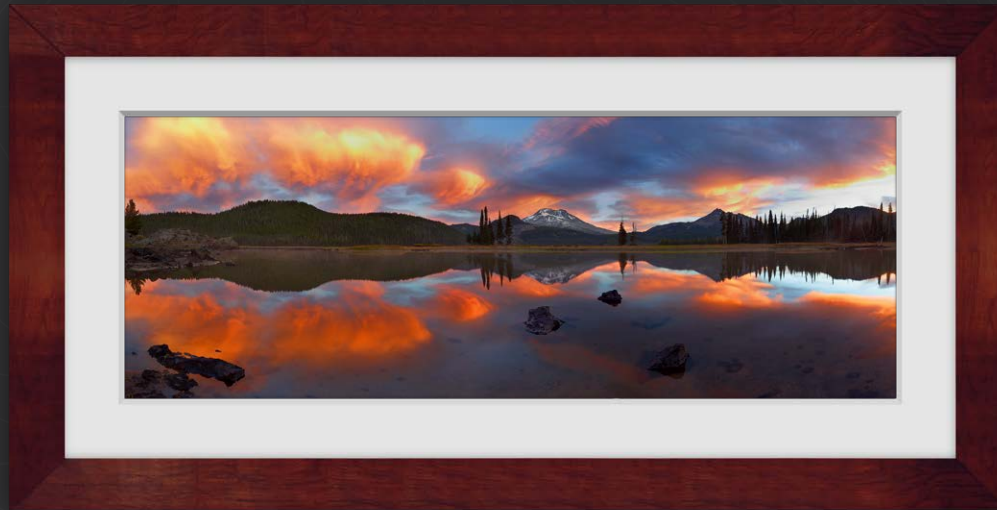
Della Terra: Cherry with White Linen