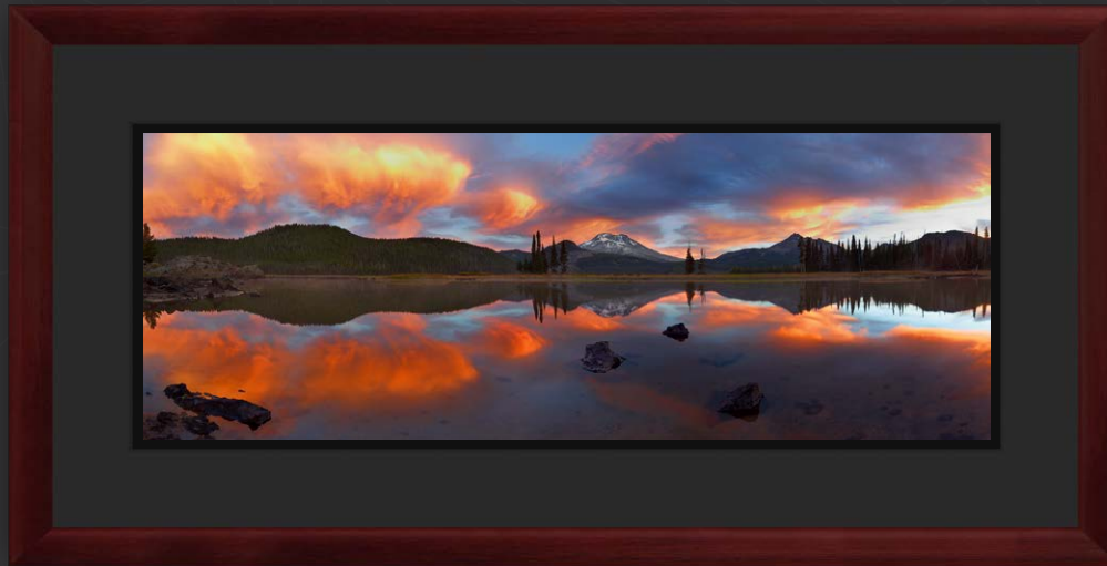
Artist Series: Black Museum Board