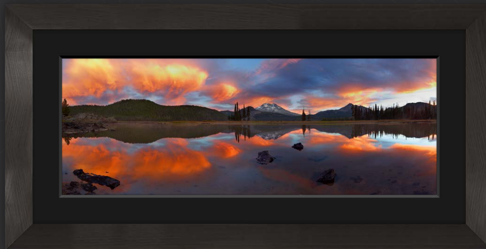
Della Terra: Charcoal with Black Linen