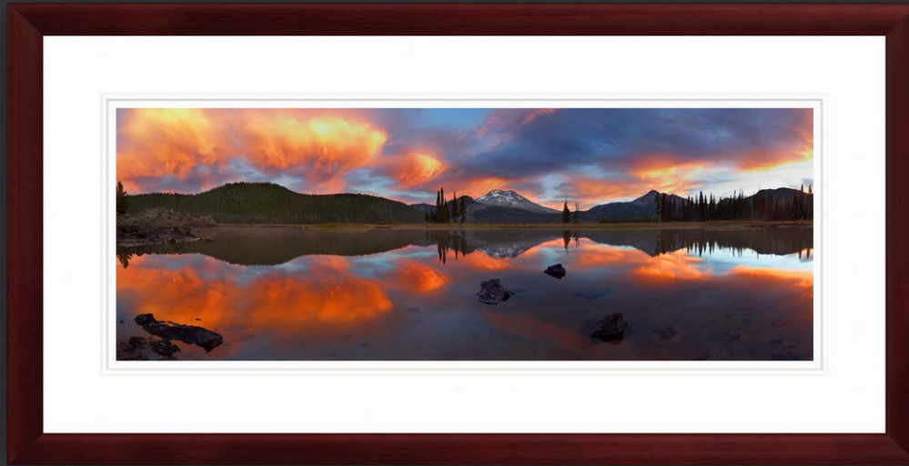
Artist Series: White Museum Board