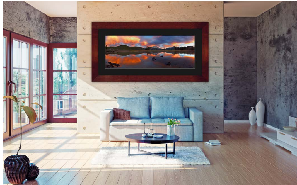
25x66 - Large Cherry with Black Linen

* Since Della Terra frames are made from sustainable forests, the trees are younger and therefore smaller. These smaller strips of veneer are applied to the frames, giving it the look of varied grain and stains - enhancing the beauty of the artwork it surrounds. Keep in mind if you see lines in the veneer, this is a natural characteristic of the wood due to the use of smaller, sustainably grown trees. These lines are not flaws. They are normal features of the materials and processes used in these high quality frames.