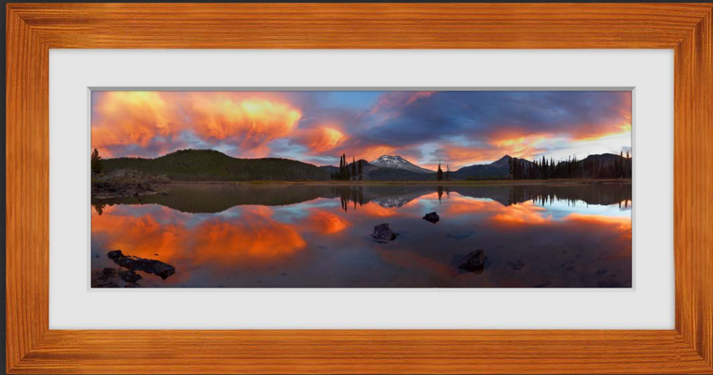
Koa with White Linen