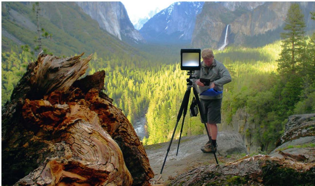
Yosemite National Park California, USA