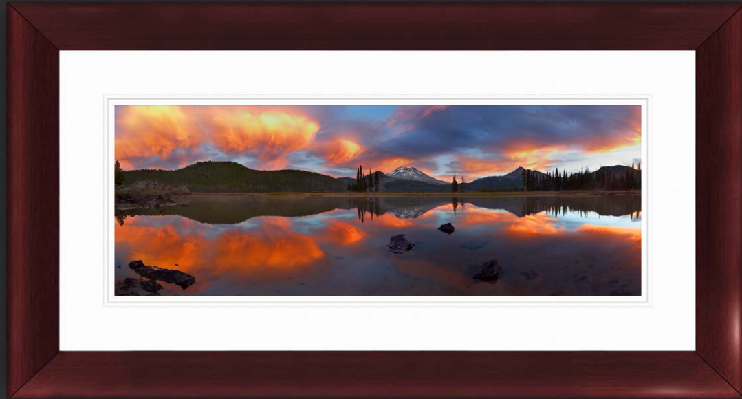
Large Artist Series: White Museum Board