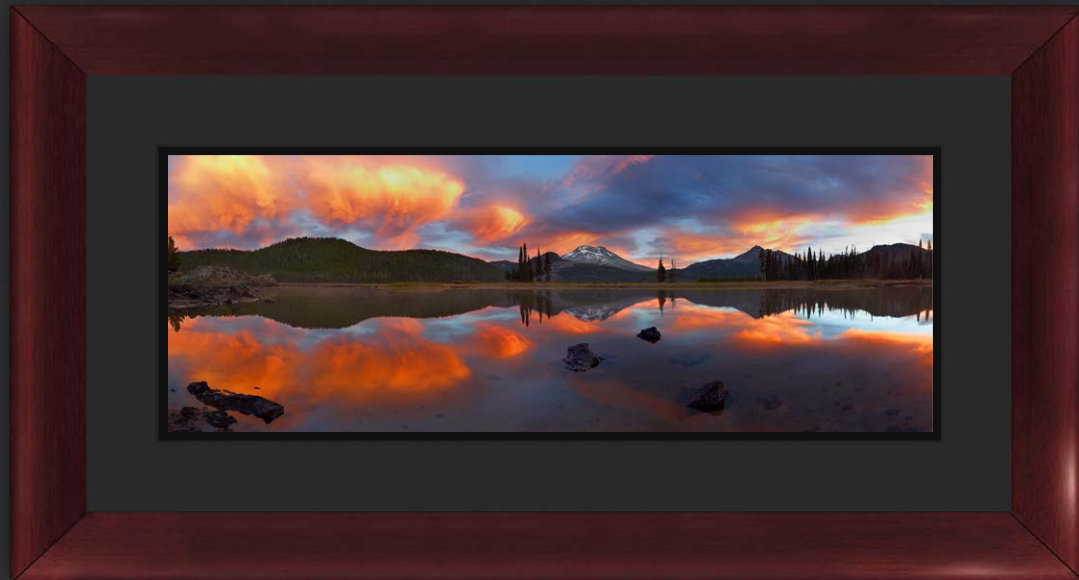
Large Artist Series: Black Museum Board