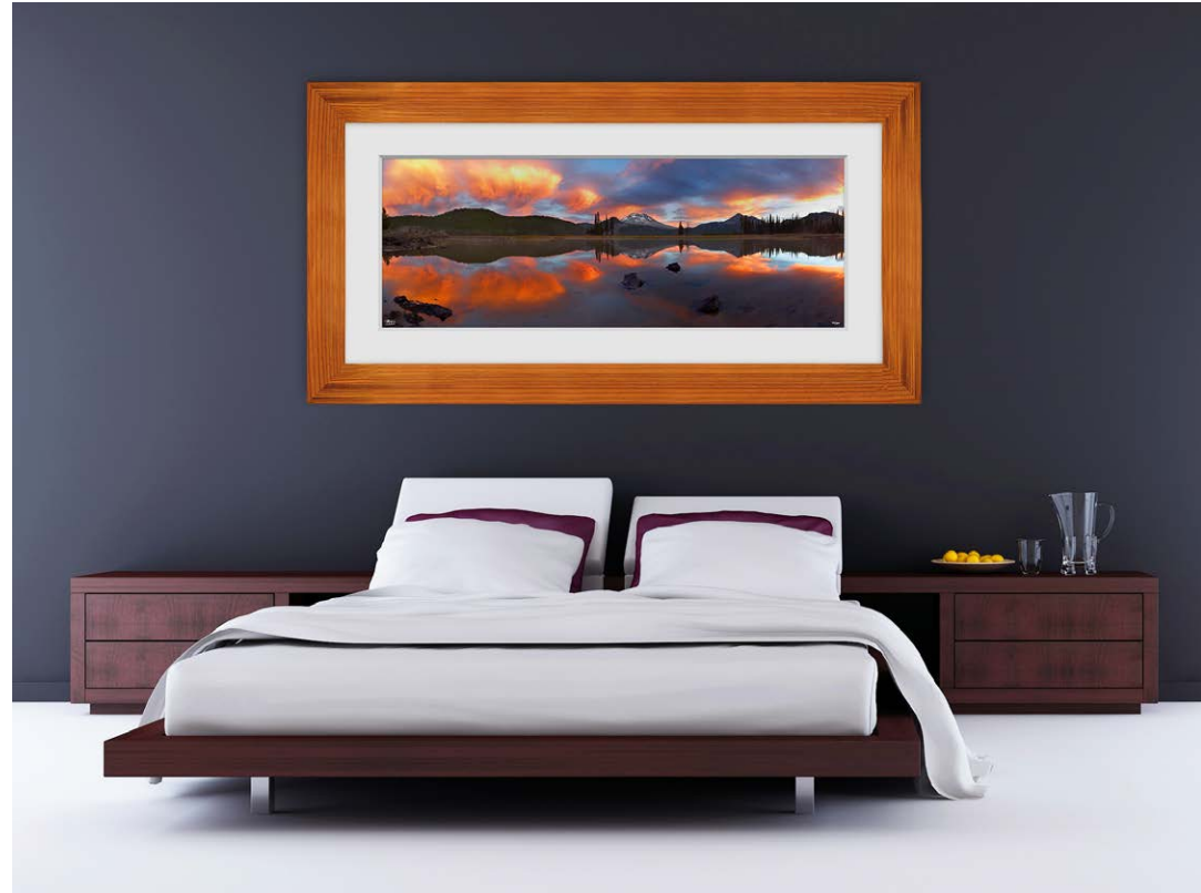
25x66 - Koa with White Linen

* Koa framing can be used on both Artist Series and Della Terra framing styles.