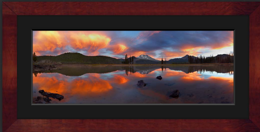
Della Terra: Cherry with Black Linen