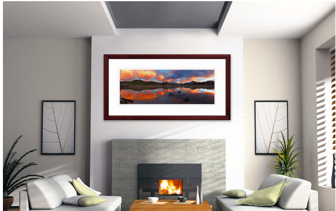
15x40 - Artist Series on White Museum Board