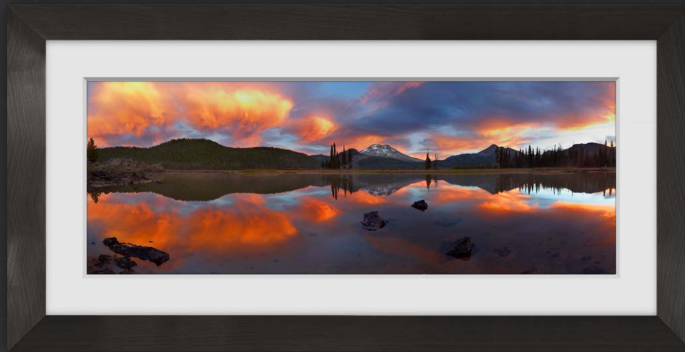
Della Terra: Charcoal with White Linen