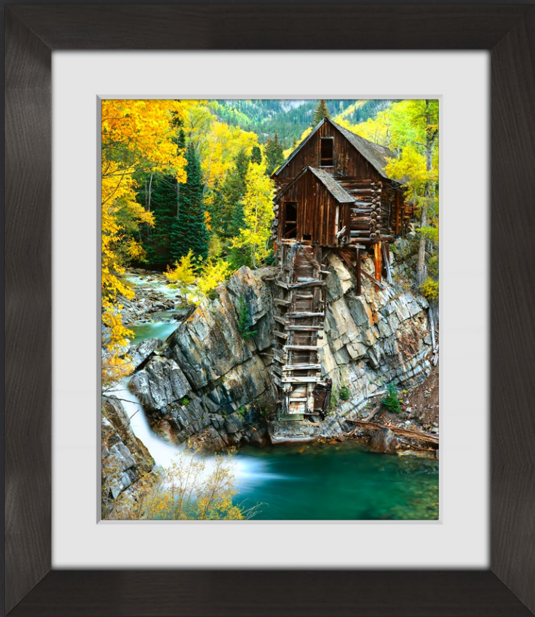
Della Terra: Charcoal with White Linen