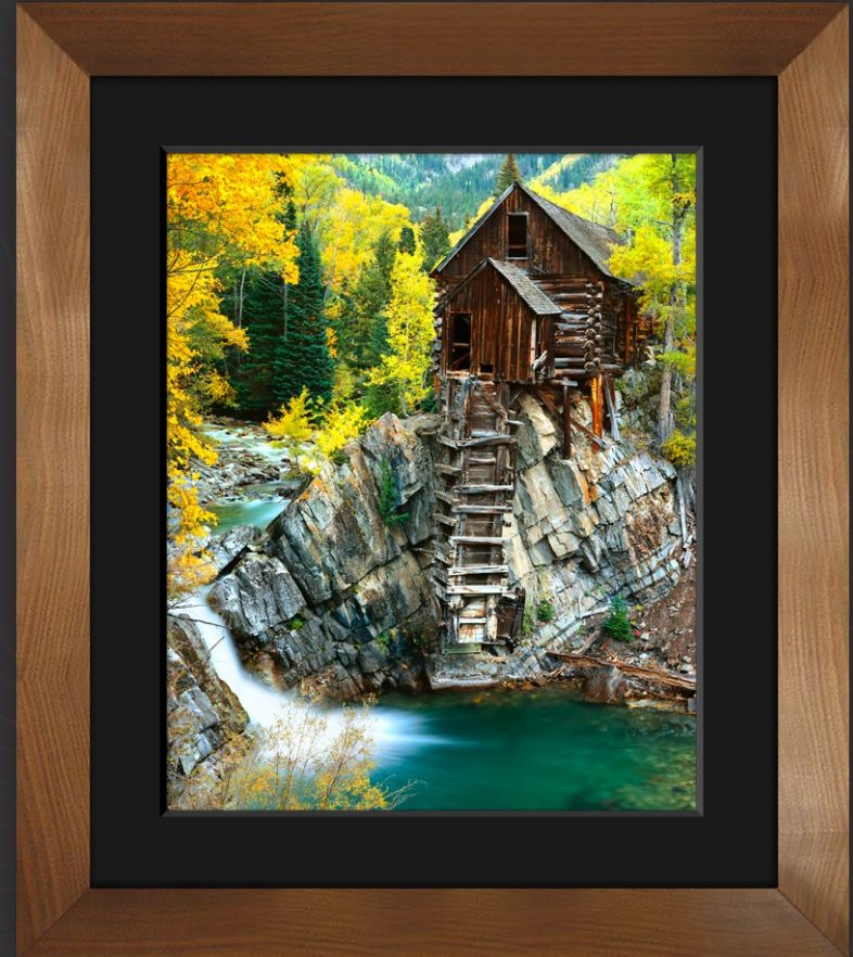
Della Terra: Walnut with Black Linen