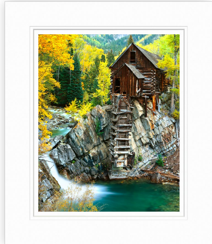
4 ply over 8 ply matte

You can choose between two classic colors: black or white. Both look fantastic.