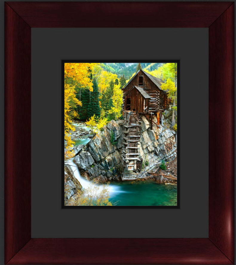
Large Artist Series: Black Museum Board