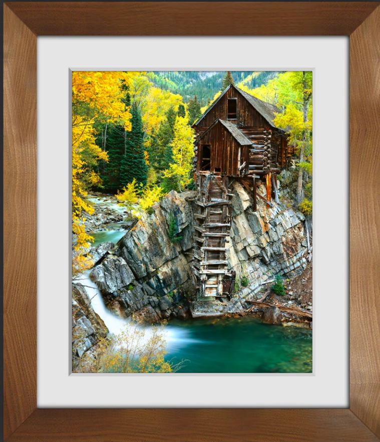
Della Terra: Walnut with White Linen