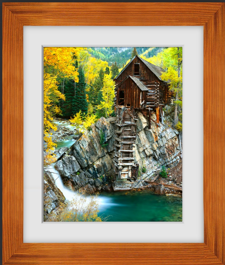
Koa with White Linen