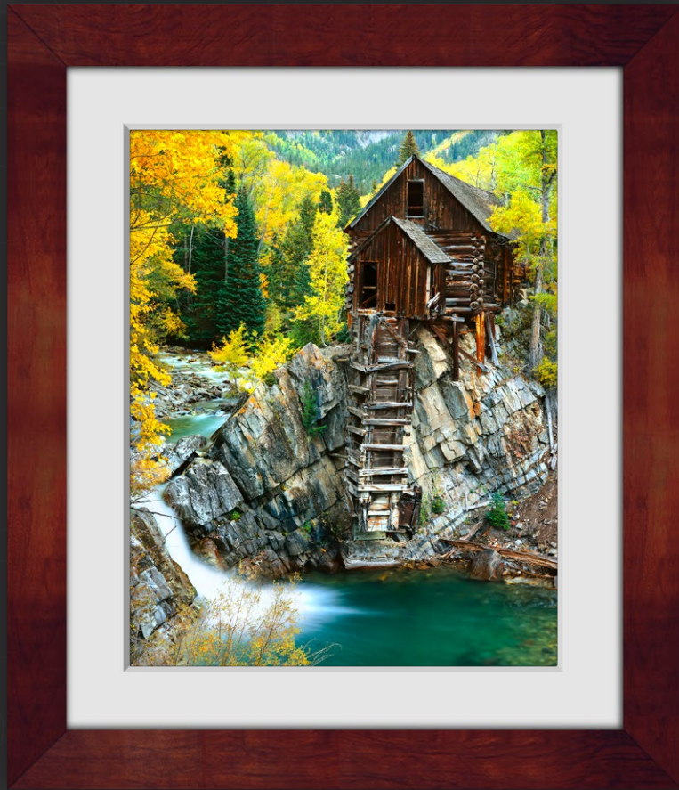
Della Terra: Cherry with White Linen