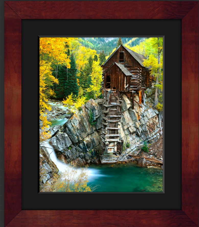
Della Terra: Cherry with Black Linen