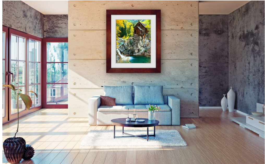
30x40 - Large Cherry with White Linen

* Since Della Terra frames are made from sustainable forests, the trees are younger and therefore smaller. These smaller strips of veneer are applied to the frames, giving it the look of varied grain and stains - enhancing the beauty of the artwork it surrounds. Keep in mind if you see lines in the veneer, this is a natural characteristic of the wood due to the use of smaller, sustainably grown trees. These lines are not flaws. They are normal features of the materials and processes used in these high quality frames.