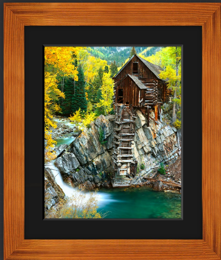
Koa with Black Linen