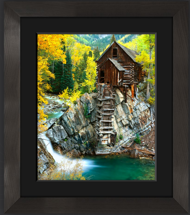
Della Terra: Charcoal with Black Linen