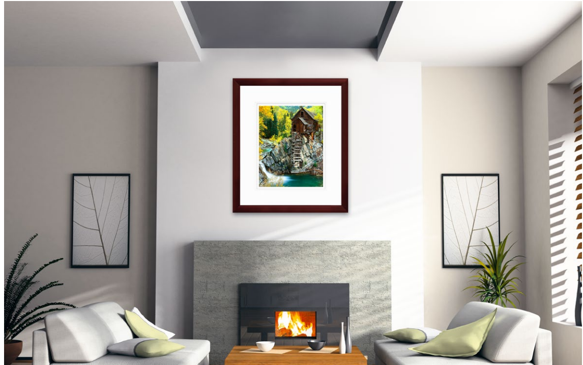
16x20 - Artist Series on White Museum Board