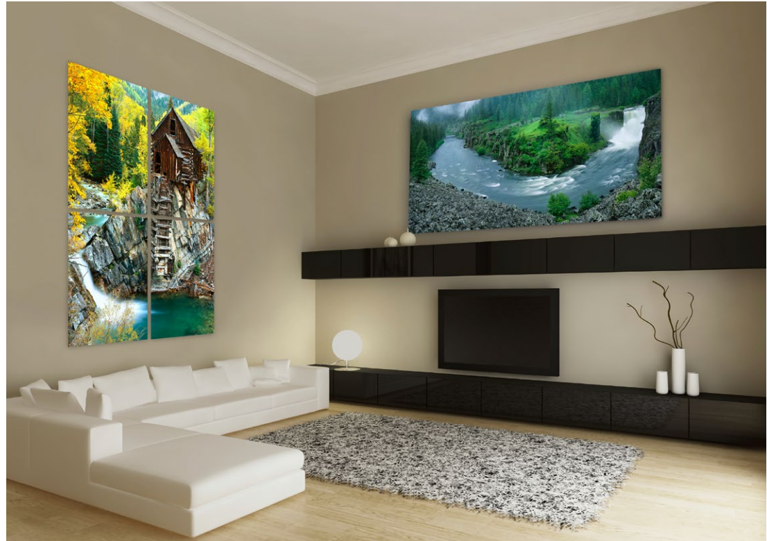
42x70 - Vista Mount

Vista Mount highlights your stunning photograph with a contemporary feel.