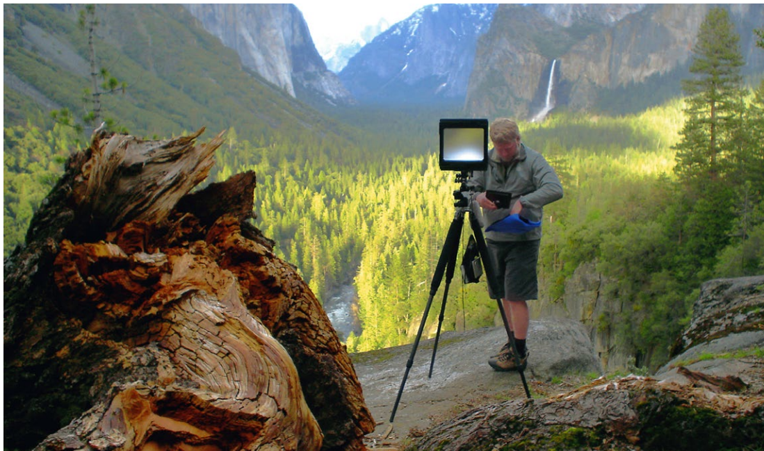
Yosemite National Park California, USA