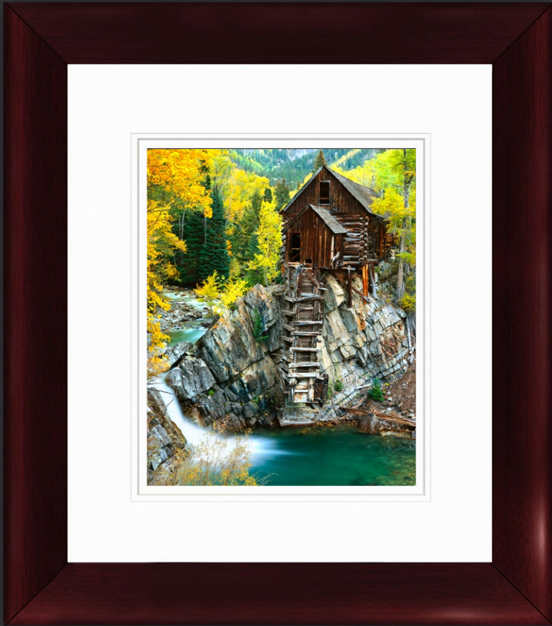
Large Artist Series: White Museum Board