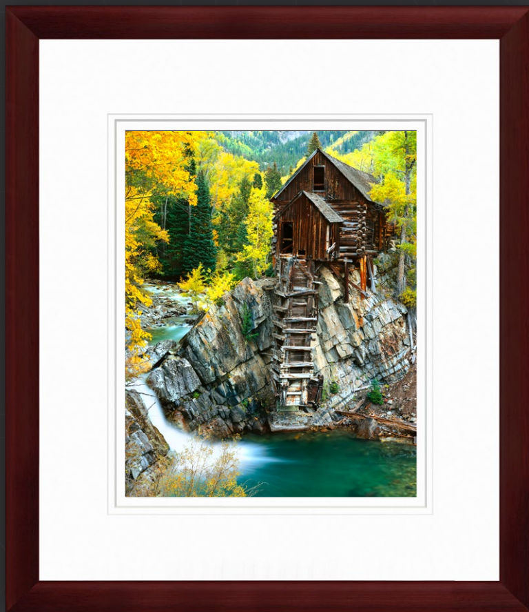
Artist Series: White Museum Board