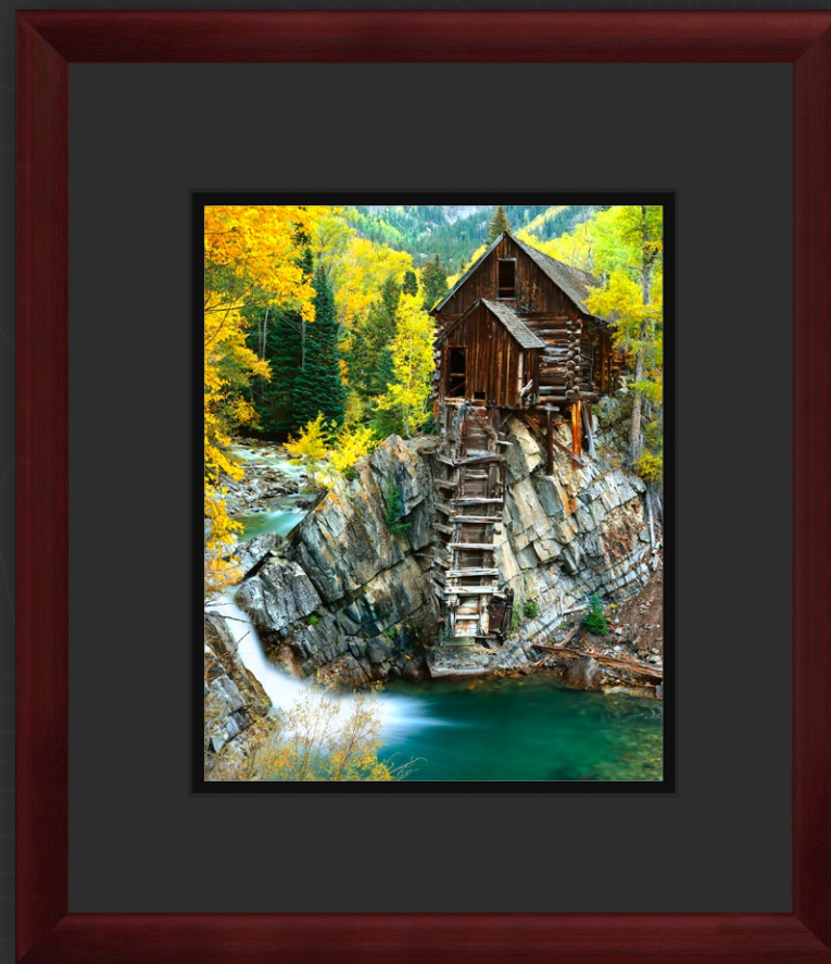
Artist Series: Black Museum Board