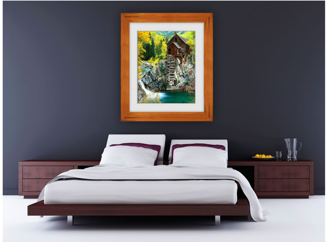
30x40 - Koa with White Linen

* Koa framing can be used on both Artist Series and Della Terra framing styles.