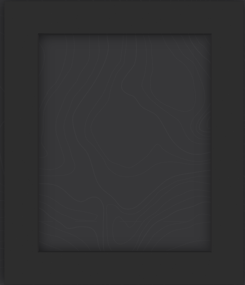
Black Museum Board