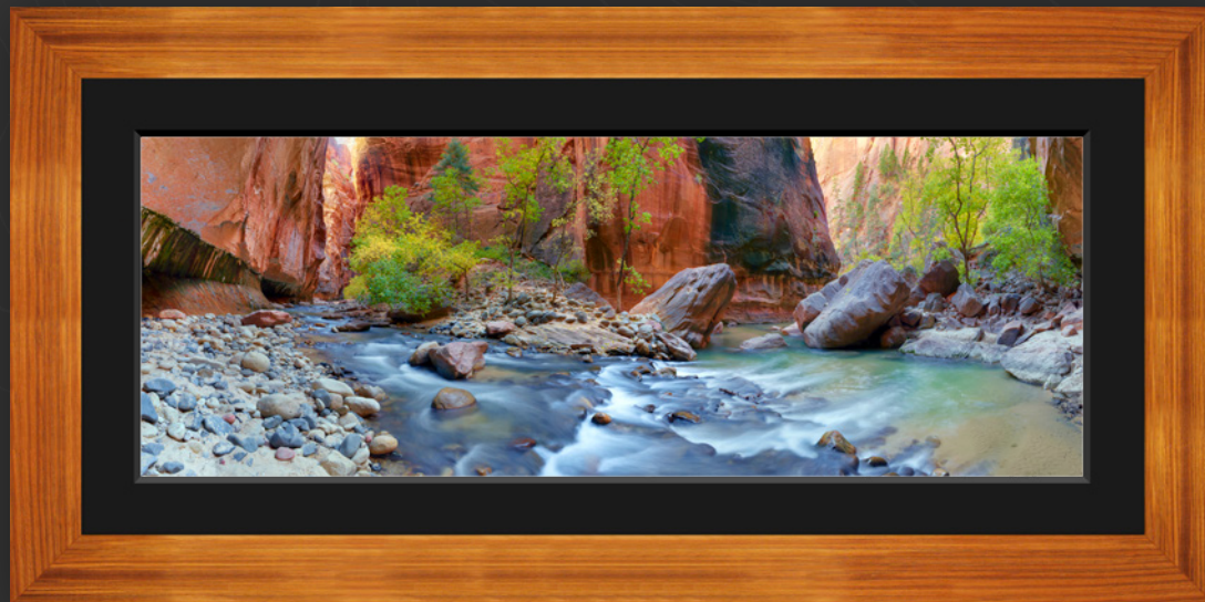
Koa with Black Liner