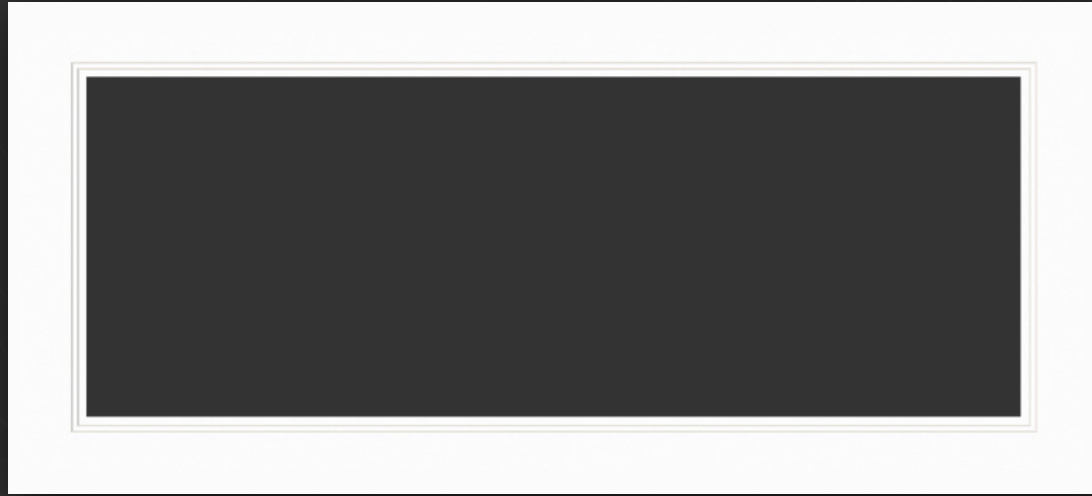
White Museum Board