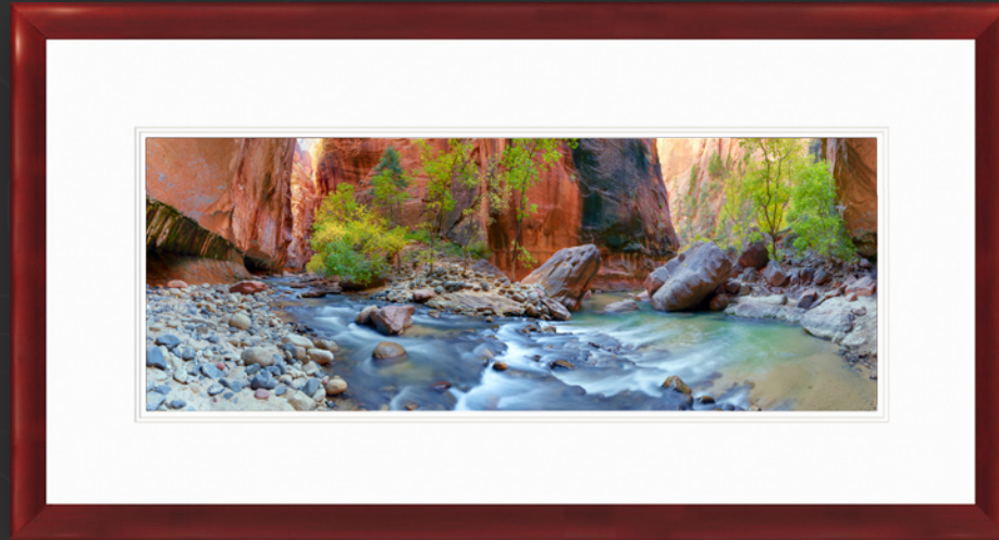
Artist Series: White Museum Board