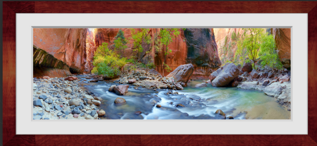
Della Terra: Cherry with White Liner