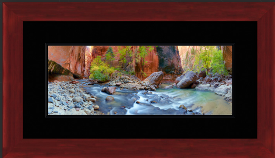
Large Artist Series: Black Museum Board