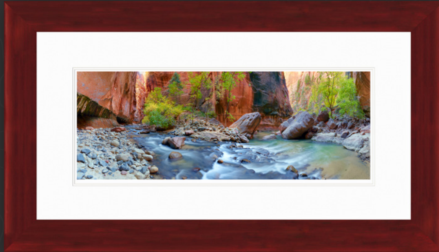
Large Artist Series: White Museum Board