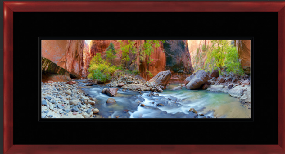
Artist Series: Black Museum Board