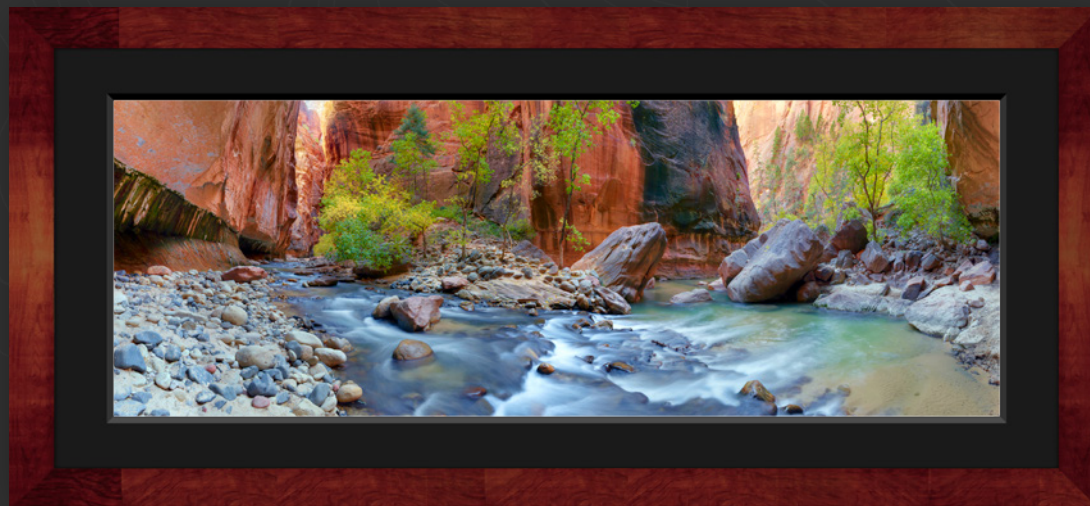
Della Terra: Cherry with Black Liner