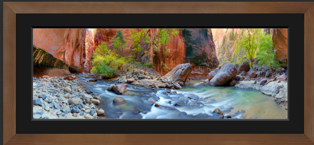
Della Terra: Walnut with Black Liner