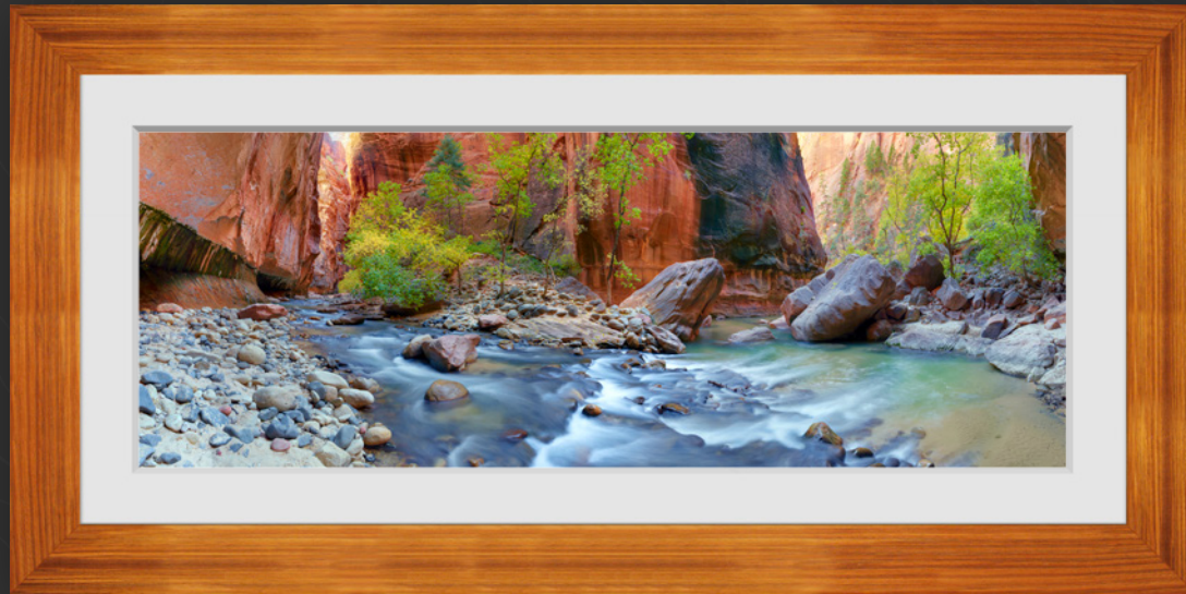
Koa with White Liner