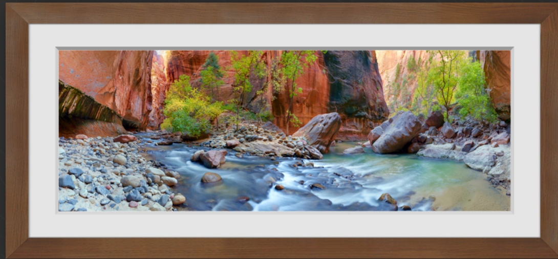
Della Terra: Walnut with White Liner