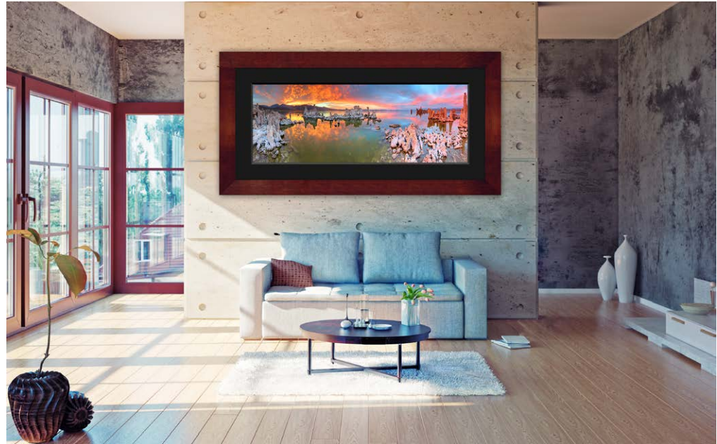
25x66 - Large Cherry with Black Linen

* Since Della Terra frames are made from sustainable forests, the trees are younger and therefore smaller. These smaller strips of veneer are applied to the frames, giving it the look of varied grain and stains - enhancing the beauty of the artwork it surrounds. Keep in mind if you see lines in the veneer, this is a natural characteristic of the wood due to the use of smaller, sustainably grown trees. These lines are not flaws. They are normal features of the materials and processes used in these high quality frames.