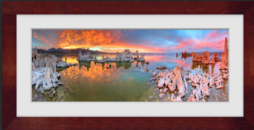
Della Terra: Cherry with White Linen