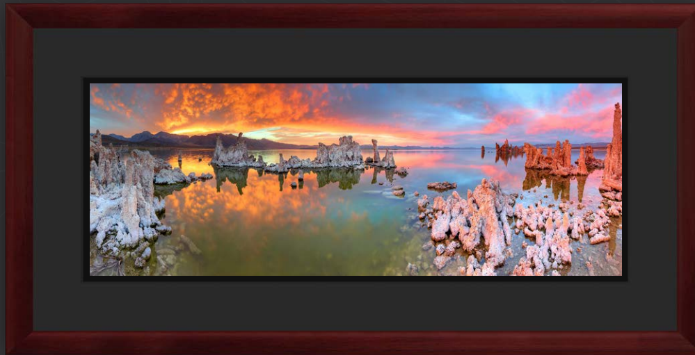
Artist Series: Black Museum Board