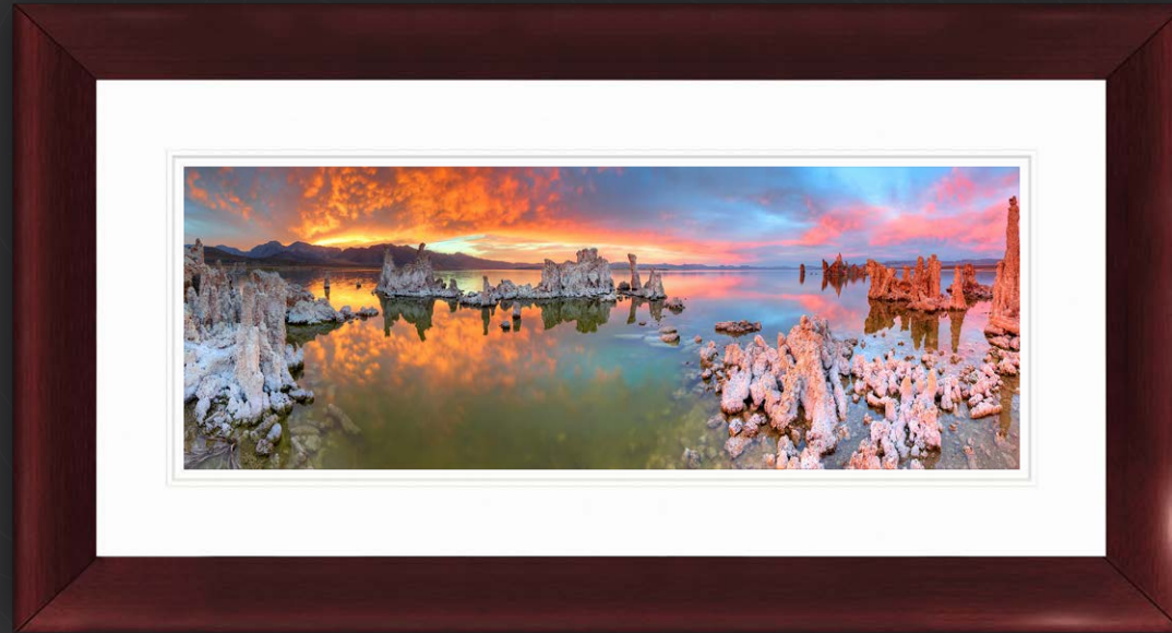
Large Artist Series: White Museum Board