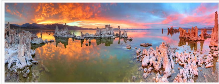
Single 8 ply matte

We offer only one type of matting for our Fine Art Photographs: Crescent museum board, in a combination of 8 ply, double 8 ply and/or 4 ply. This cotton museum board was designed specifically for the Metropolitan Museum of Art in the late 1920s, and now is used in almost all museums and libraries worldwide. All of our museum boards are 100-percent cotton. This ensures an entirely acid-free and PH balanced environment for your Fine Art Photograph, allowing for year after year of carefree enjoyment. The museum board is sized to your image perfectly and features a traditional beveled cut. You can choose between two classics: black or white. Both look fantastic.