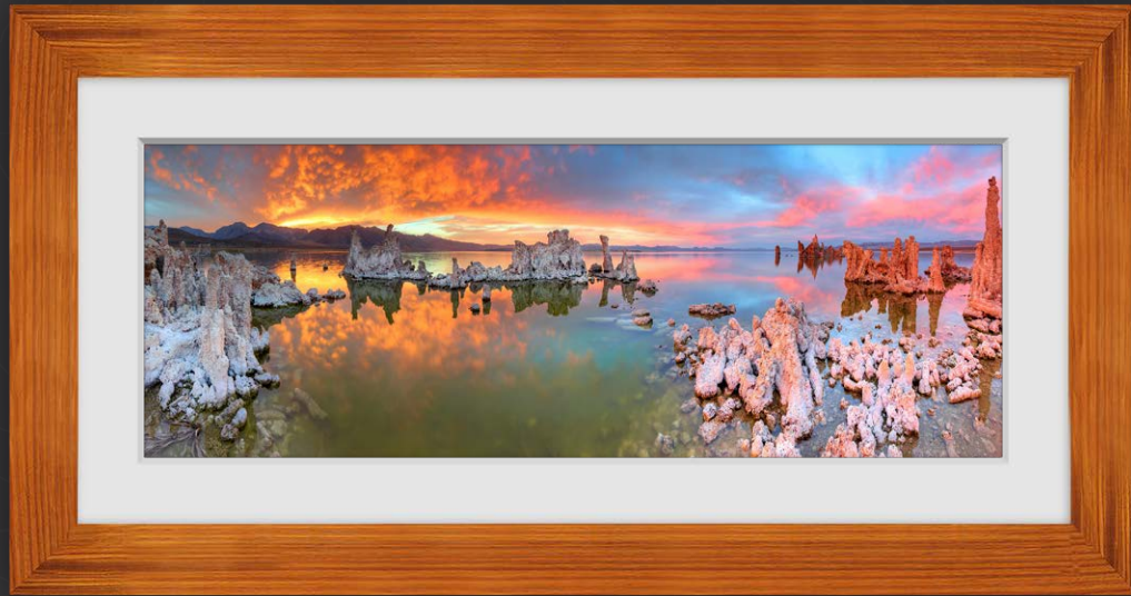
Koa with White Linen