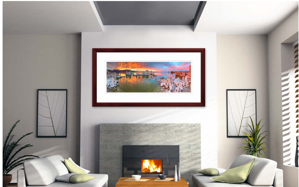
15x40 - Artist Series on White Museum Board