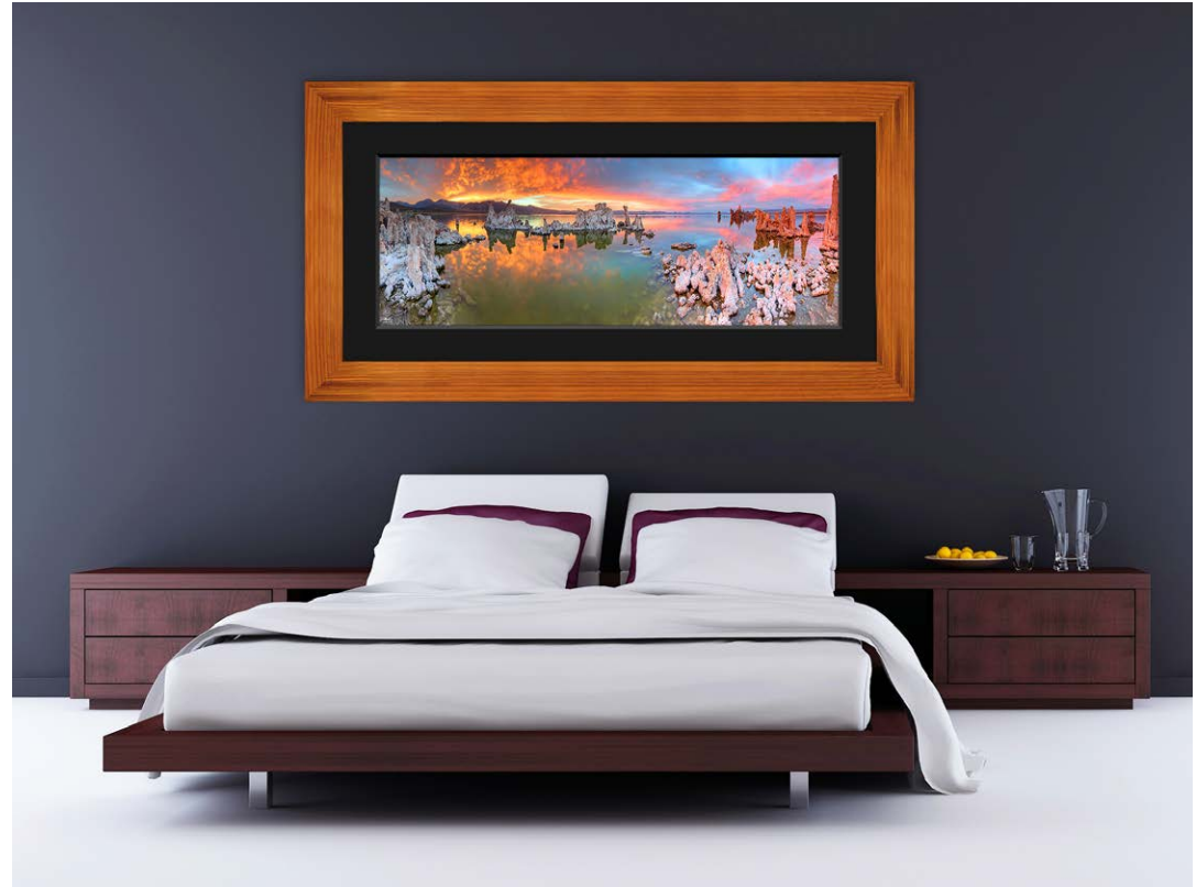
25x66 - Koa with Black Linen

* Koa framing can be used on both Artist Series and Della Terra framing styles.