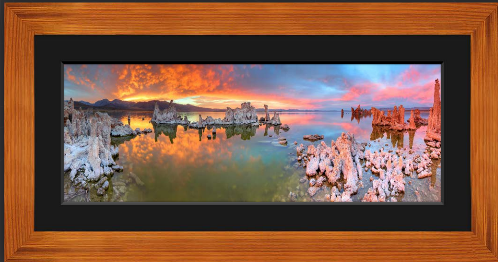
Koa with Black Linen