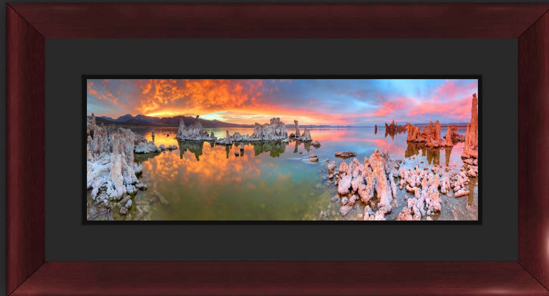
Large Artist Series: Black Museum Board