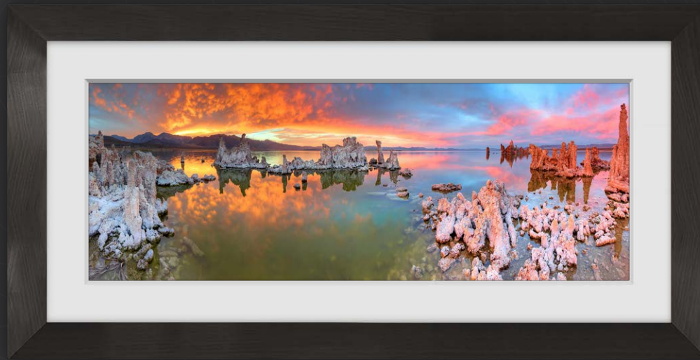
Della Terra: Charcoal with White Linen