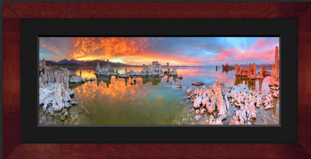
Della Terra: Cherry with Black Linen