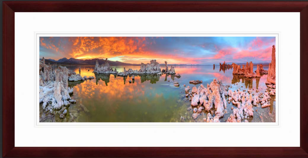
Artist Series: White Museum Board