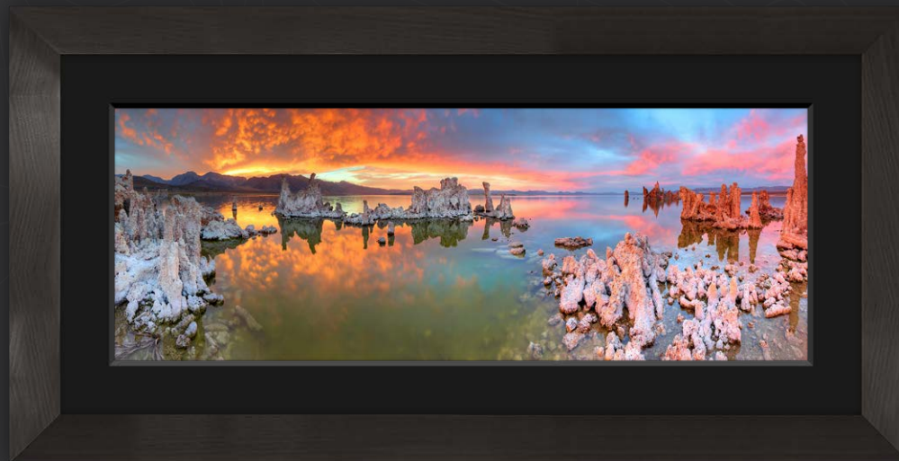
Della Terra: Charcoal with Black Linen