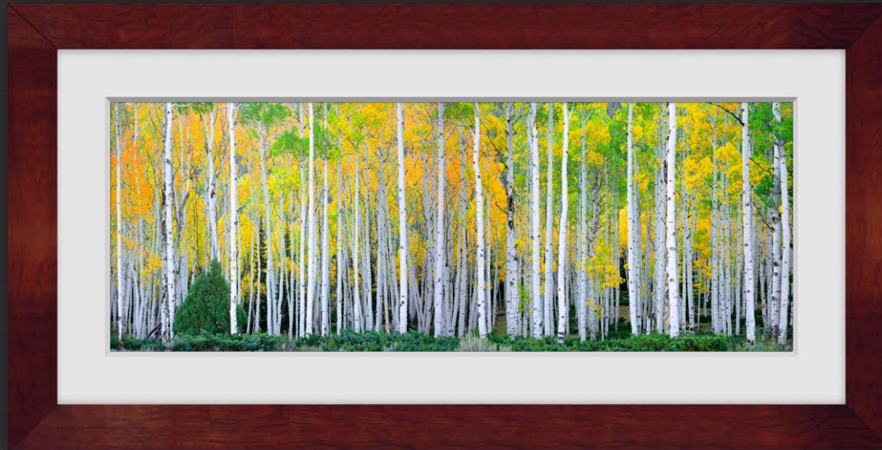
Della Terra: Cherry with White Linen