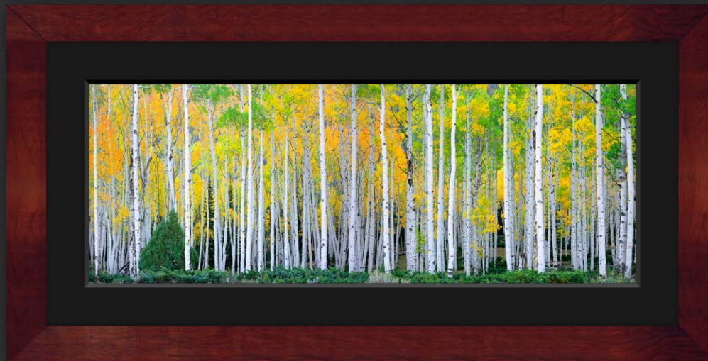
Della Terra: Cherry with Black Linen