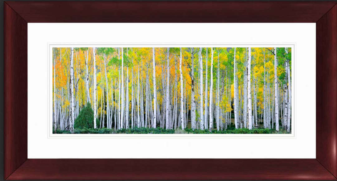
Large Artist Series: White Museum Board