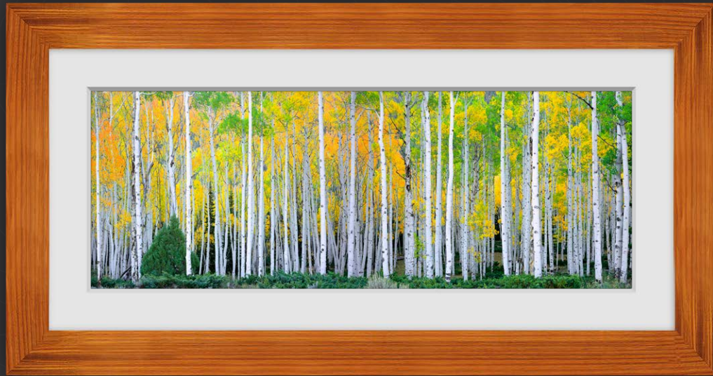
Koa with White Linen