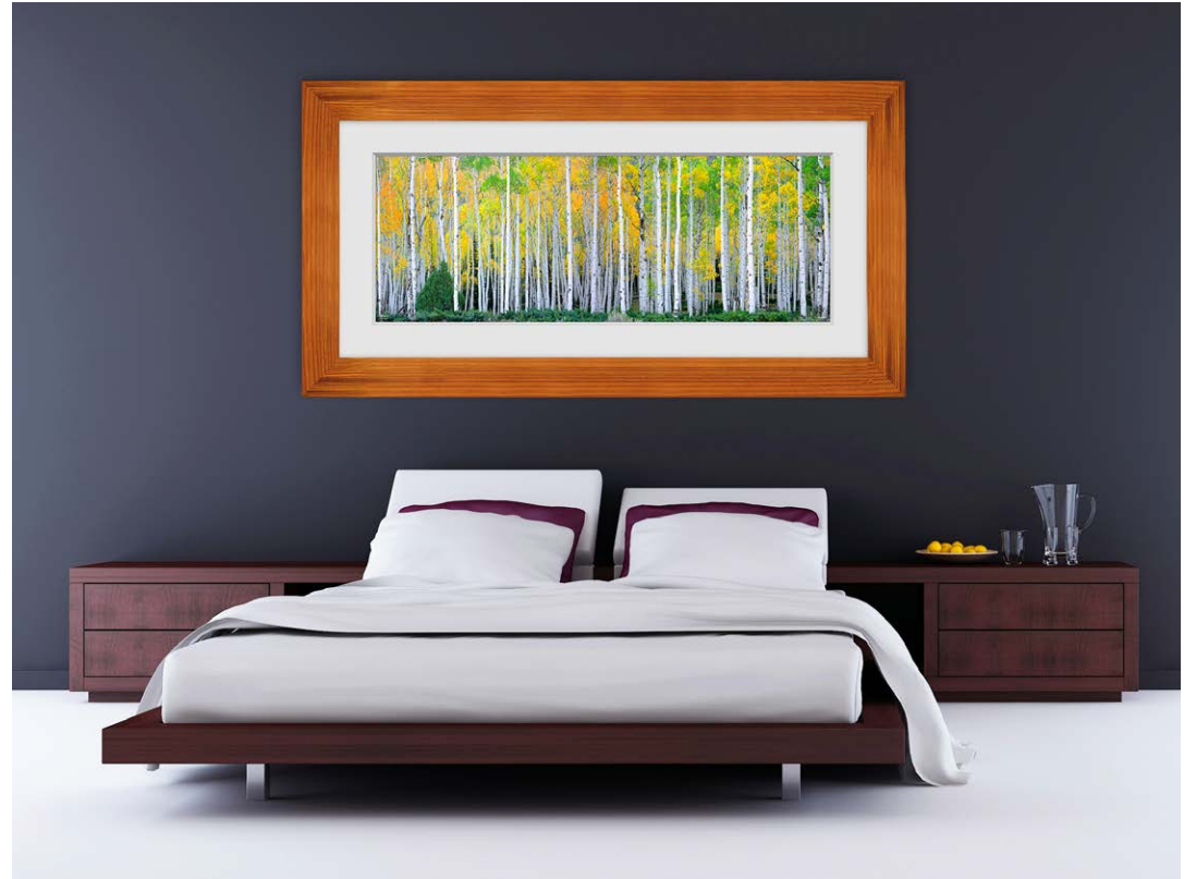
25x66 - Koa with White Linen

* Koa framing can be used on both Artist Series and Della Terra framing styles.