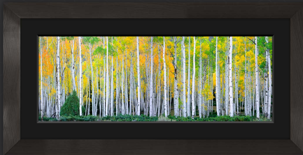
Della Terra: Charcoal with Black Linen