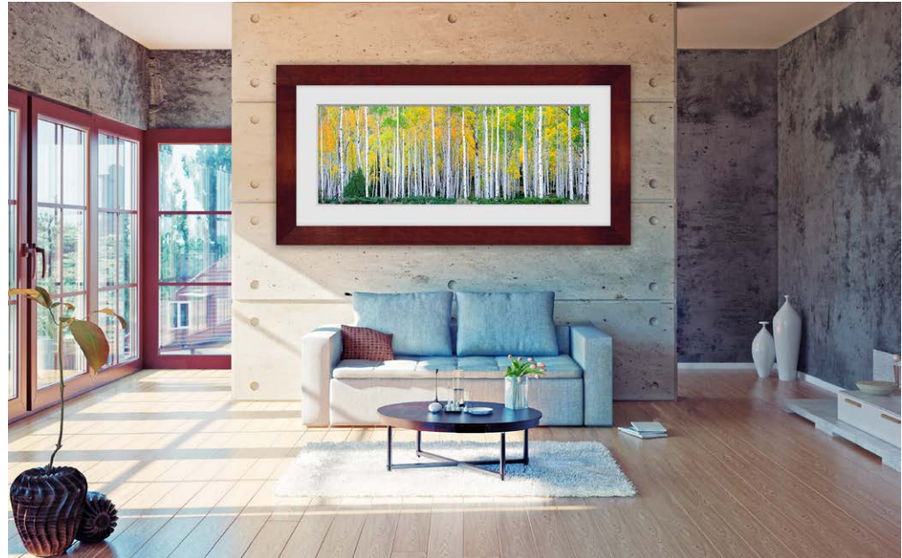
25x66 - Large Cherry with White Linen

* Since Della Terra frames are made from sustainable forests, the trees are younger and therefore smaller. These smaller strips of veneer are applied to the frames, giving it the look of varied grain and stains - enhancing the beauty of the artwork it surrounds. Keep in mind if you see lines in the veneer, this is a natural characteristic of the wood due to the use of smaller, sustainably grown trees. These lines are not flaws. They are normal features of the materials and processes used in these high quality frames.