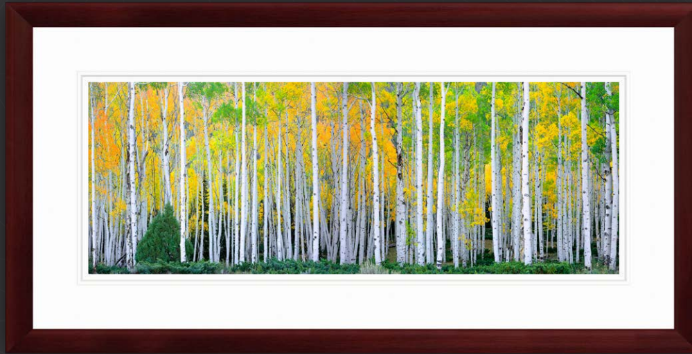
Artist Series: White Museum Board