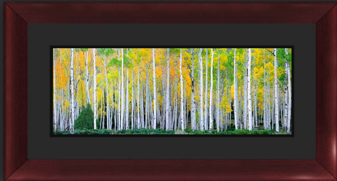
Large Artist Series: Black Museum Board