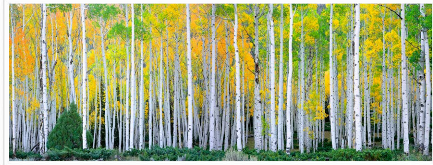
Single 8 ply matte

We offer only one type of matting for our Fine Art Photographs: Crescent museum board, in a combination of 8 ply, double 8 ply and/or 4 ply. This cotton museum board was designed specifically for the Metropolitan Museum of Art in the late 1920s, and now is used in almost all museums and libraries worldwide. All of our museum boards are 100-percent cotton. This ensures an entirely acid-free and PH balanced environment for your Fine Art Photograph, allowing for year after year of carefree enjoyment. The museum board is sized to your image perfectly and features a traditional beveled cut. You can choose between two classics: black or white. Both look fantastic.