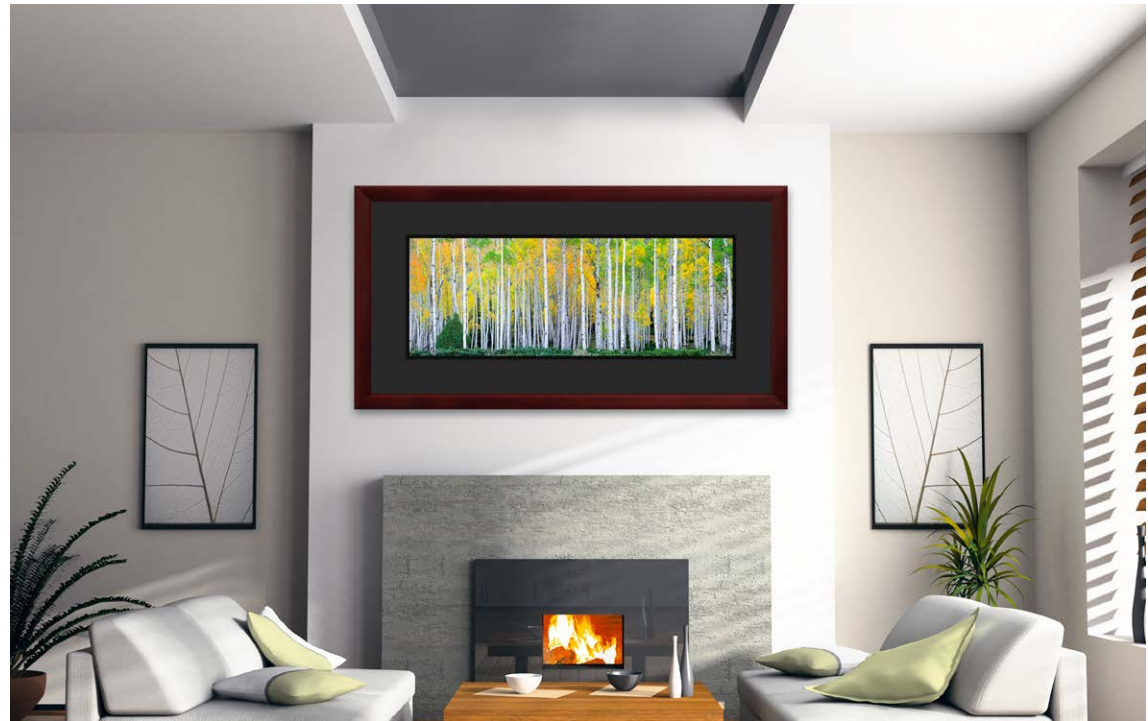
15x40 - Artist Series on Black Museum Board