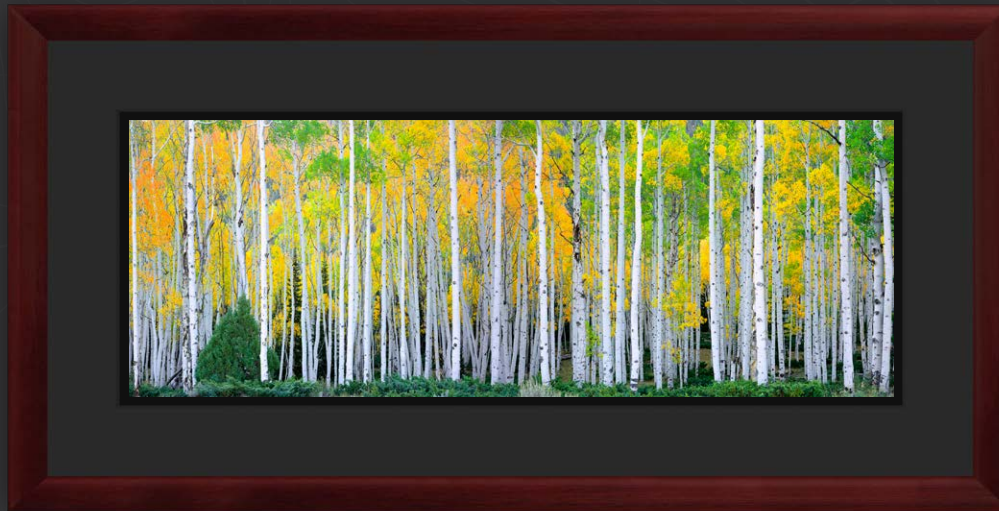
Artist Series: Black Museum Board