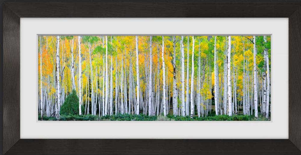
Della Terra: Charcoal with White Linen