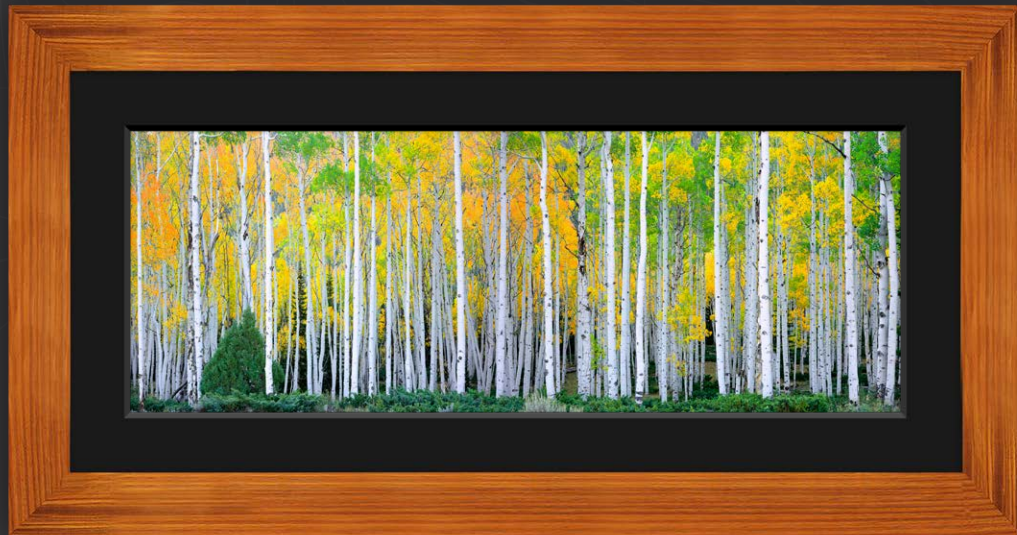
Koa with Black Linen