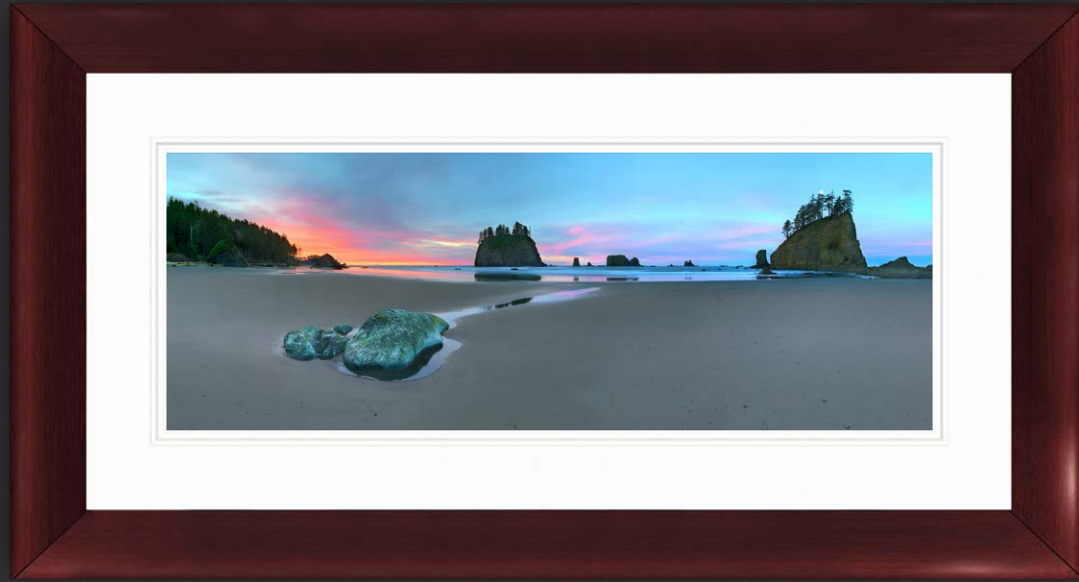
Large Artist Series: White Museum Board