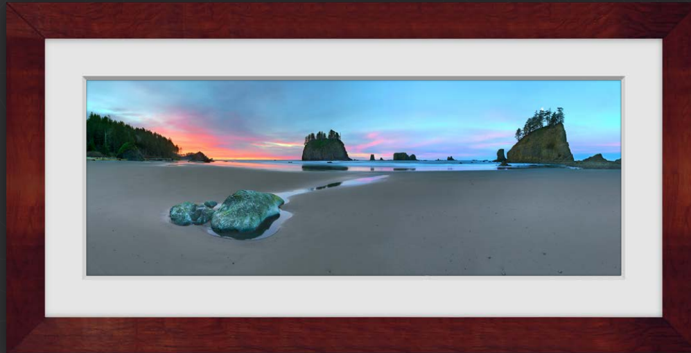
Della Terra: Cherry with White Linen