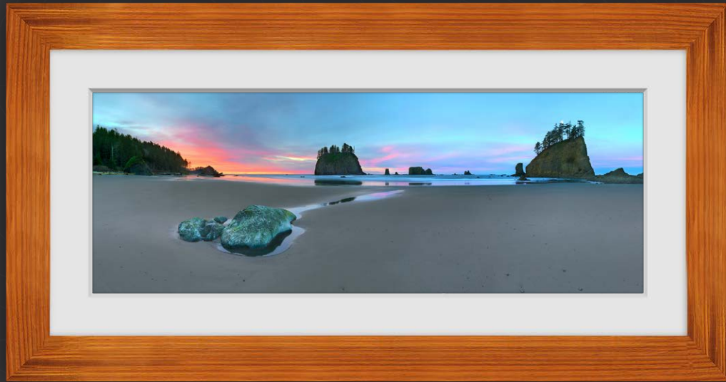
Koa with White Linen