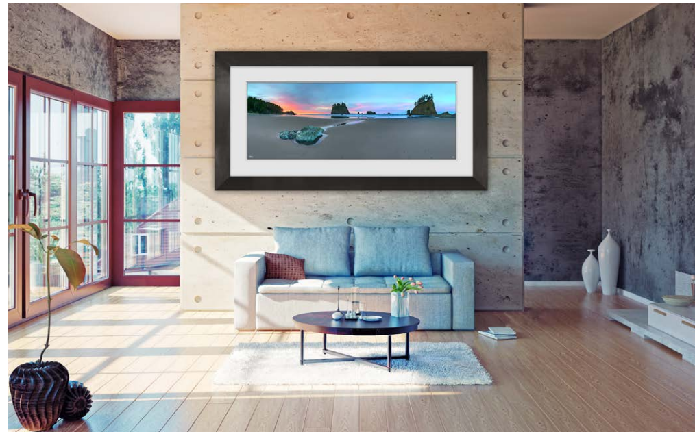
25x66 - Large Charcoal with White Linen

* Since Della Terra frames are made from sustainable forests, the trees are younger and therefore smaller. These smaller strips of veneer are applied to the frames, giving it the look of varied grain and stains - enhancing the beauty of the artwork it surrounds. Keep in mind if you see lines in the veneer, this is a natural characteristic of the wood due to the use of smaller, sustainably grown trees. These lines are not flaws. They are normal features of the materials and processes used in these high quality frames.