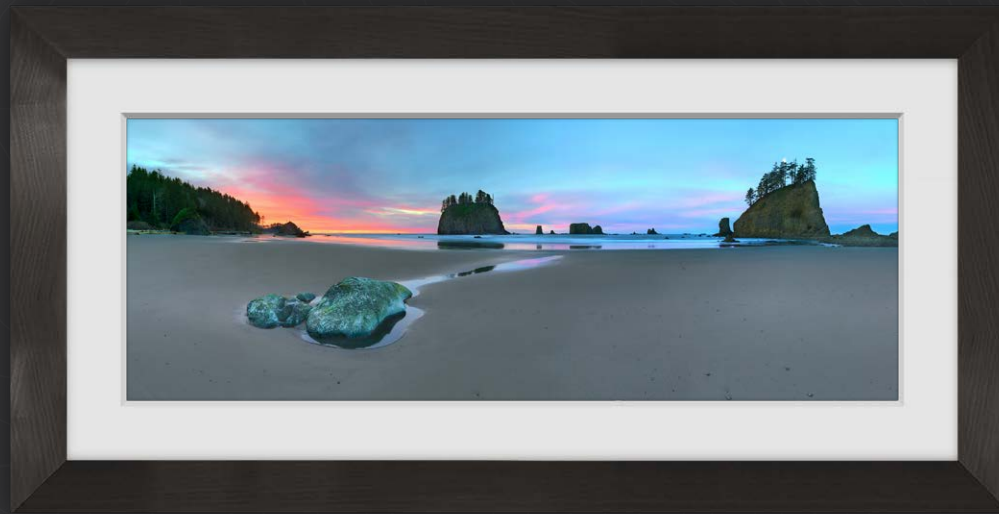
Della Terra: Charcoal with White Linen