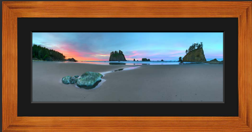
Koa with Black Linen