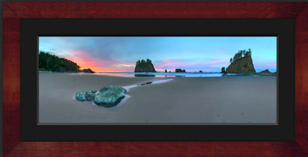
Della Terra: Cherry with Black Linen