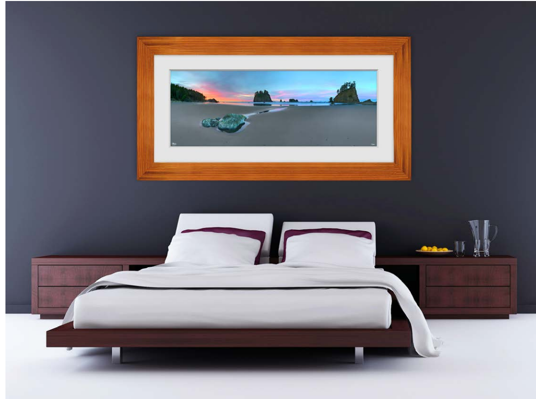
25x66 - Koa with White Linen

* Koa framing can be used on both Artist Series and Della Terra framing styles.