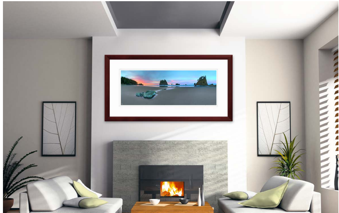
15x40 - Artist Series on White Museum Board