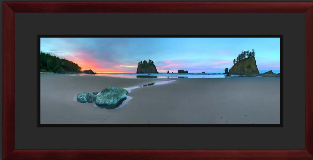
Artist Series: Black Museum Board