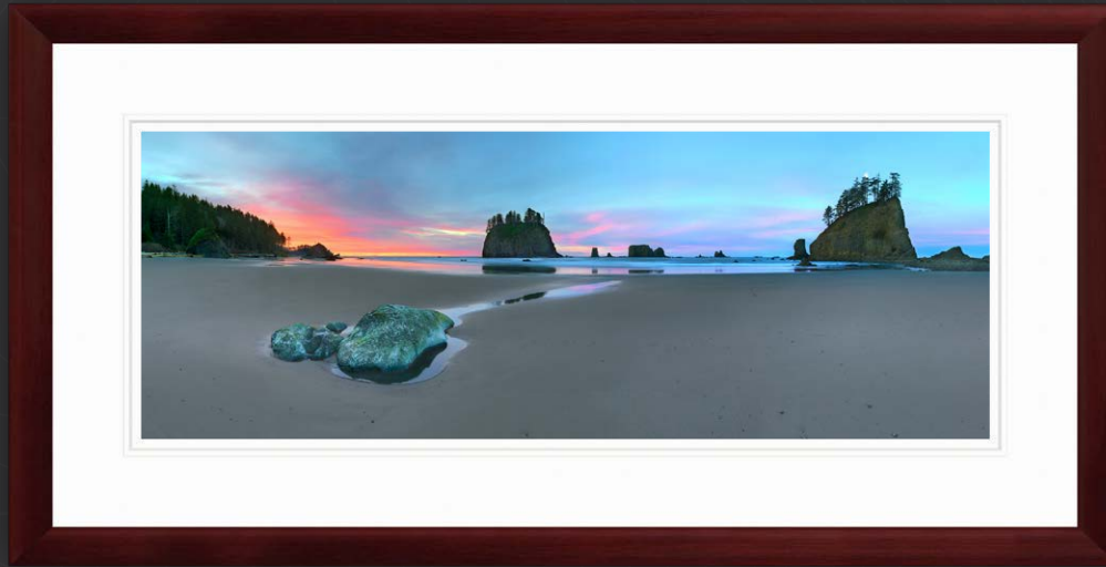
Artist Series: White Museum Board