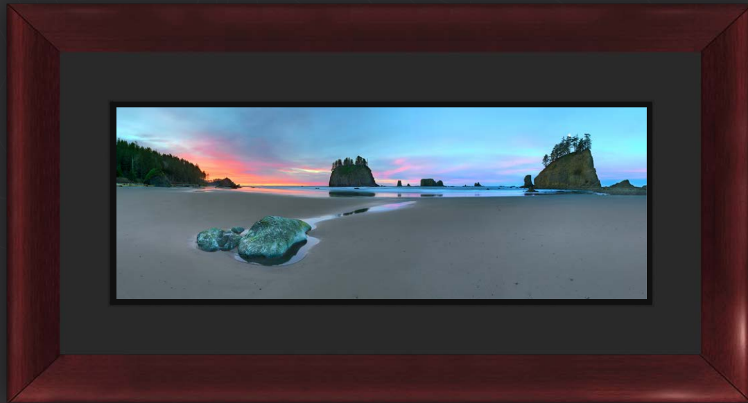
Large Artist Series: Black Museum Board