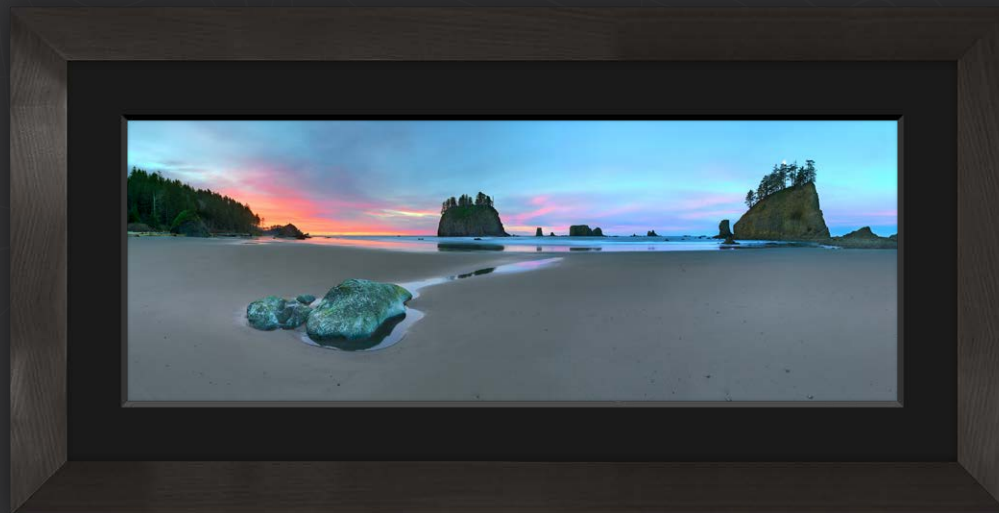
Della Terra: Charcoal with Black Linen