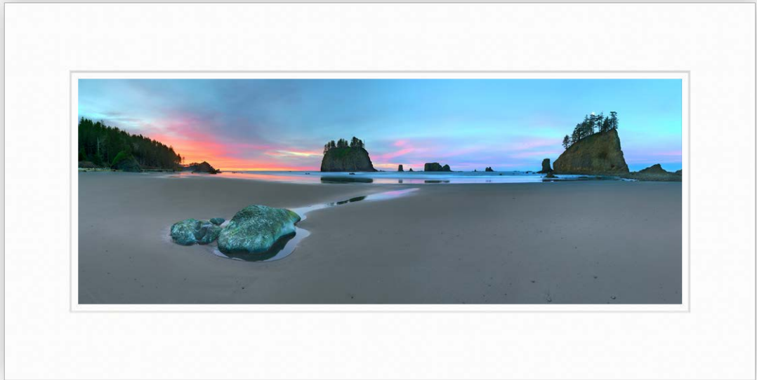
Single 8 ply matte

We offer only one type of matting for our Fine Art Photographs: Crescent museum board, in a combination of 8 ply, double 8 ply and/or 4 ply. This cotton museum board was designed specifically for the Metropolitan Museum of Art in the late 1920s, and now is used in almost all museums and libraries worldwide. All of our museum boards are 100-percent cotton. This ensures an entirely acid-free and PH balanced environment for your Fine Art Photograph, allowing for year after year of carefree enjoyment. The museum board is sized to your image perfectly and features a traditional beveled cut. You can choose between two classics: black or white. Both look fantastic.