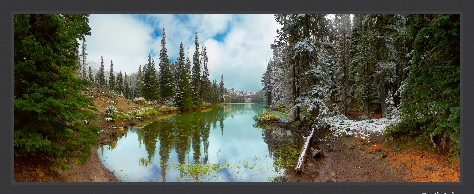
Devils Lake Deschutes National Forest Oregon, USA