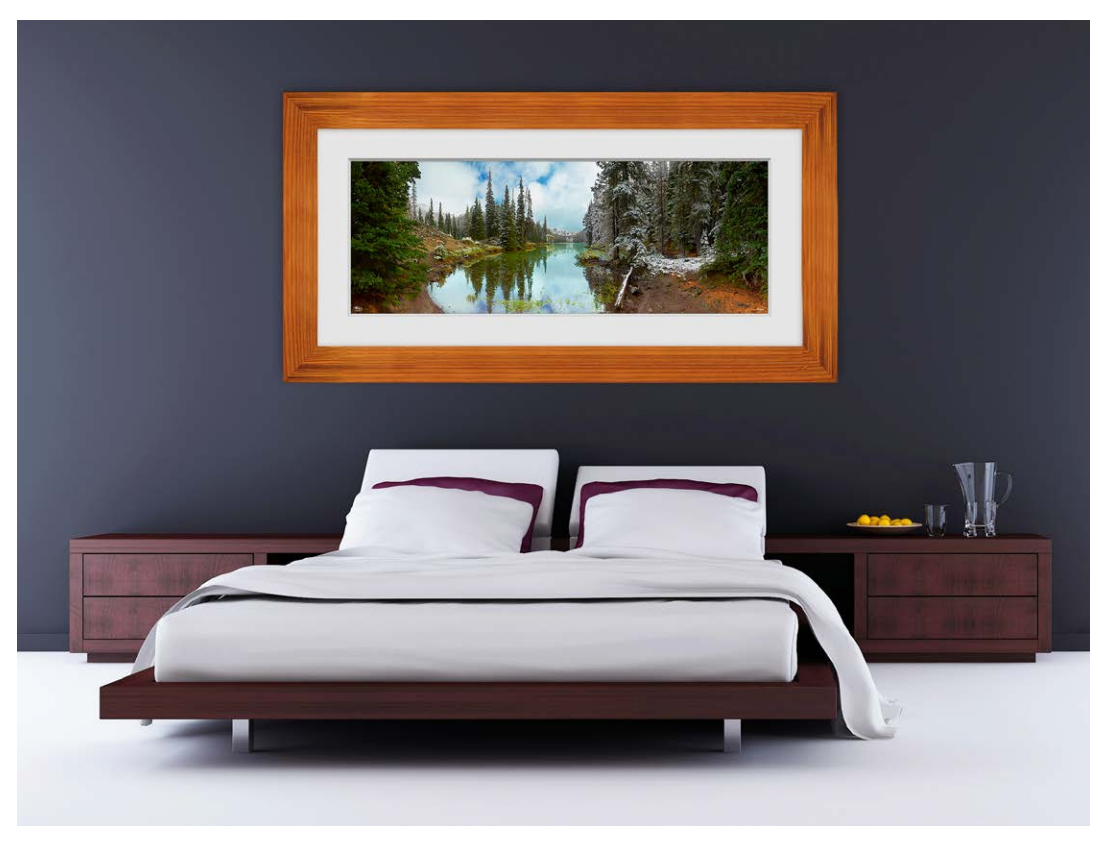
25x66 - Koa with White Linen

* Koa framing can be used on both Artist Series and Della Terra framing styles.