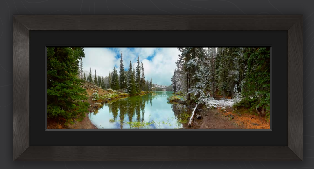
Della Terra: Charcoal with Black Linen