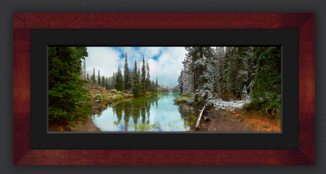
Della Terra: Cherry with Black Linen