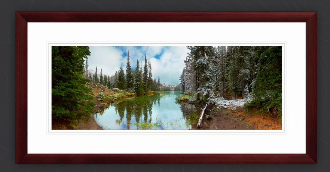
Artist Series: White Museum Board