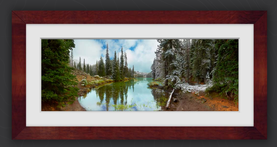
Della Terra: Cherry with White Linen