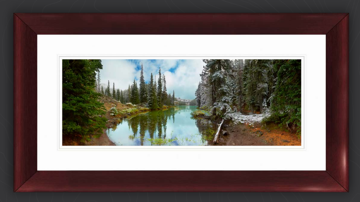
Large Artist Series: White Museum Board