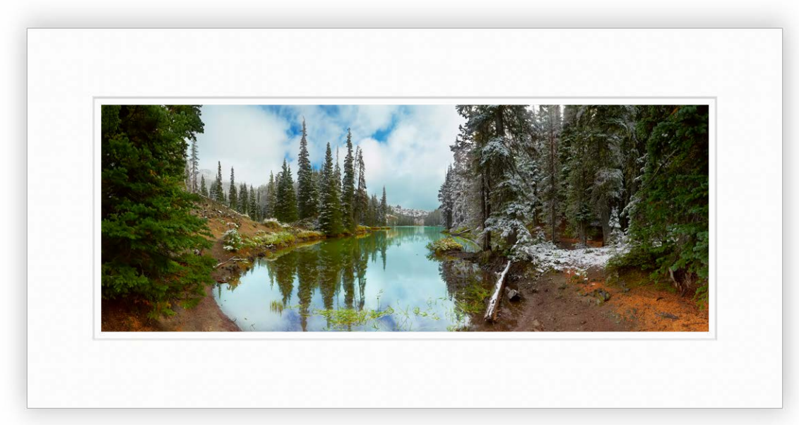
Single 8 ply matte

We offer only one type of matting for our Fine Art Photographs: Crescent museum board, in a combination of 8 ply, double 8 ply and/or 4 ply. This cotton museum board was designed specifically for the Metropolitan Museum of Art in the late 1920s, and now is used in almost all museums and libraries worldwide. All of our museum boards are 100-percent cotton. This ensures an entirely acid-free and PH balanced environment for your Fine Art Photograph, allowing for year after year of carefree enjoyment. The museum board is sized to your image perfectly and features a traditional beveled cut. You can choose between two classics: black or white. Both look fantastic.