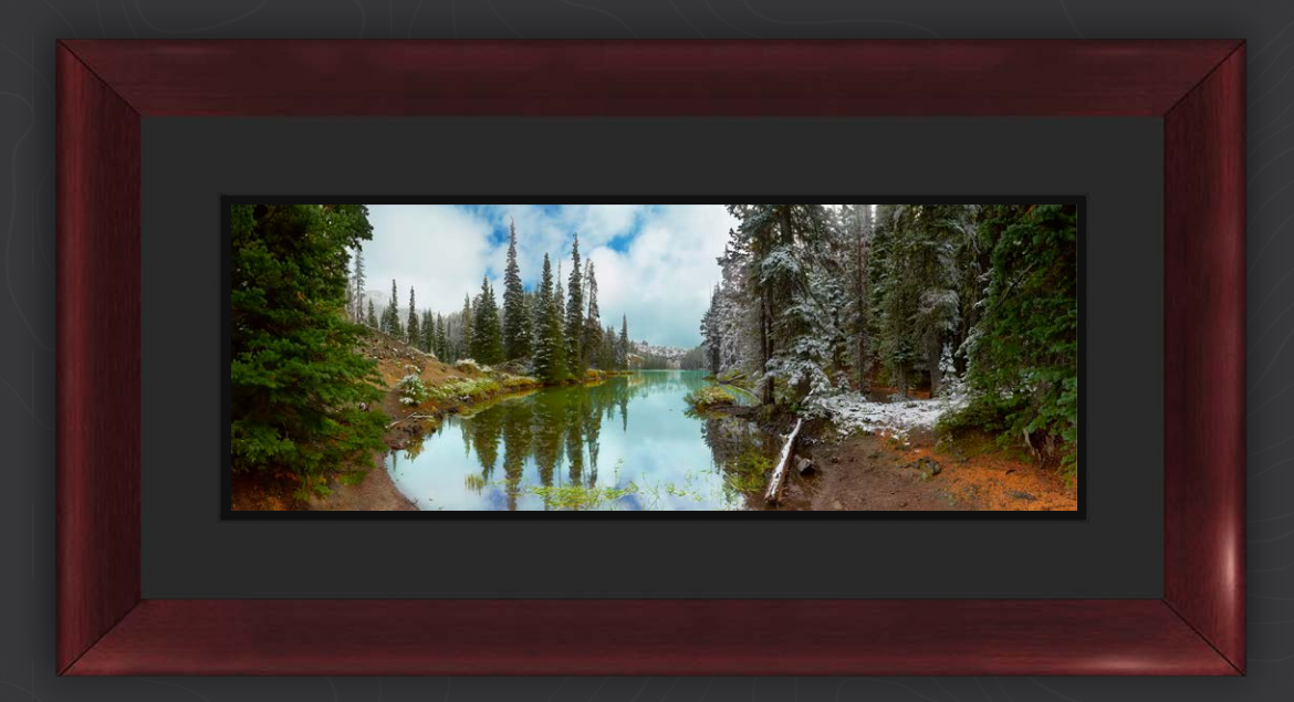
Large Artist Series: Black Museum Board