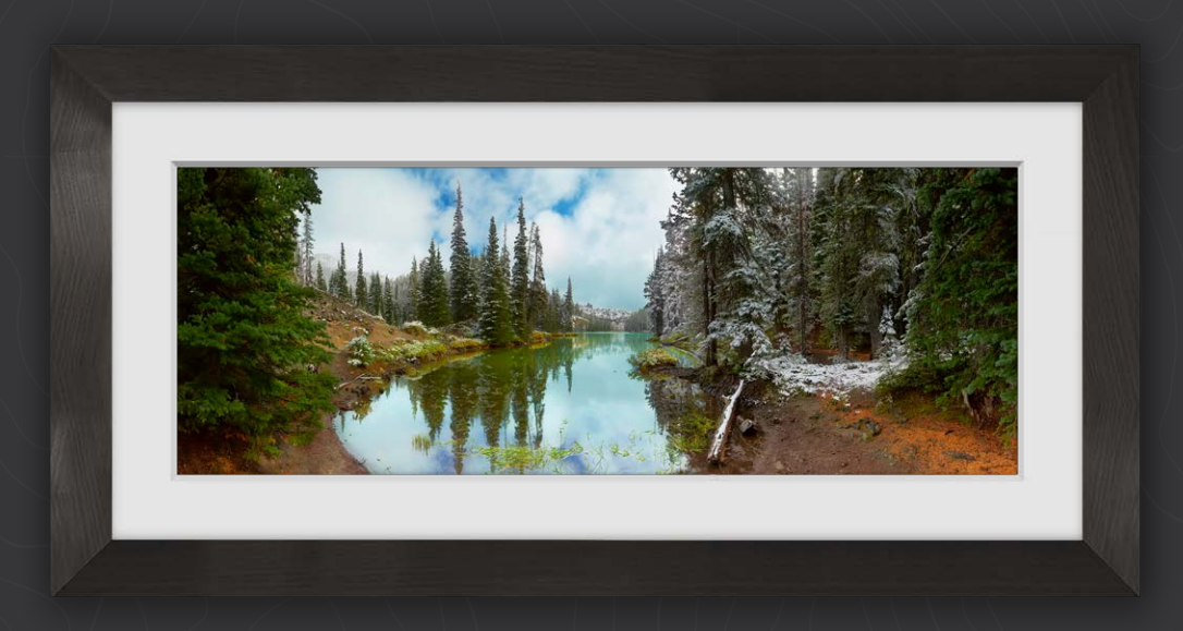
Della Terra: Charcoal with White Linen