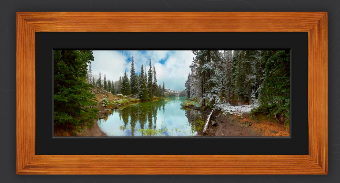
Koa with Black Liner