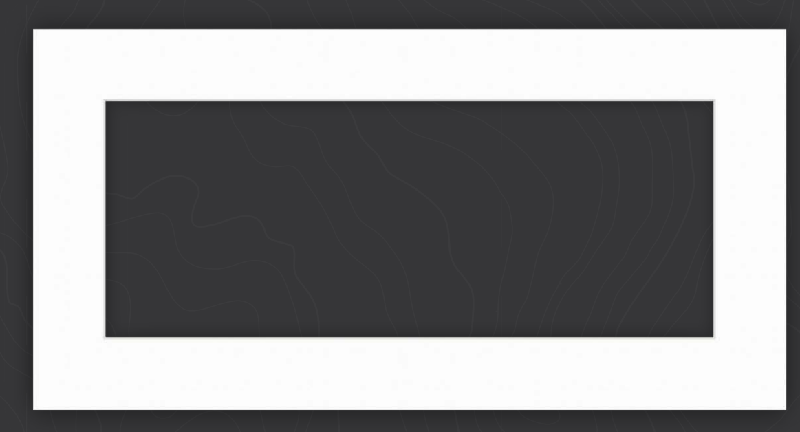
White Museum Board