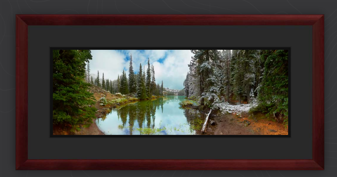
Artist Series: Black Museum Board