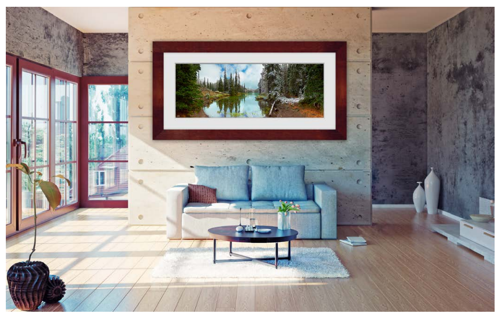
25x66 - Large Cherry with White Linen