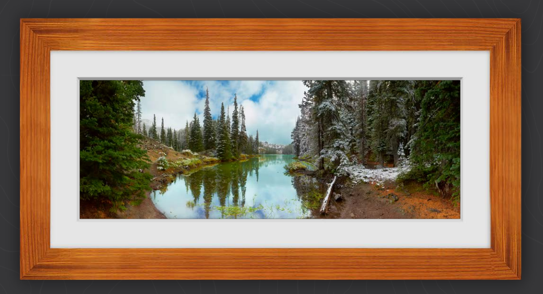
Koa with White Linen